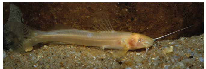
Figure 3. Imparfinis mirini complete albino, identified as Rhamdella minuta in Sazima & Pombal (1986). Adult specimen 46.4 mm SL (ZUEC 1438).

We refrained here from labelling our report on Cambeva guareiensis as a first case of albinism within the genus, even if it seems to be the only record of an albino of this species, and the second case of complete albinism within Trichomycteridae (Carvalho & de Pinna 1986; Trajano 1997). To illustrate our point, an albino described by Sazima & Pombal Jr (1986) was identified as Rhamdella minuta Lütken, 1874, according to the taxonomic knowledge of this group at the time of publication (H. A. Britski pers. comm.). However, I.S. later recognized the specimen as Imparfinis mirini Haseman, 1911 (Figure 3). Unaware of this situation, Manoel et al. (2017) reported on a first case of albinism in I. mirini , when the supposed R. minuta was, indeed, the first record of albinism the former species.