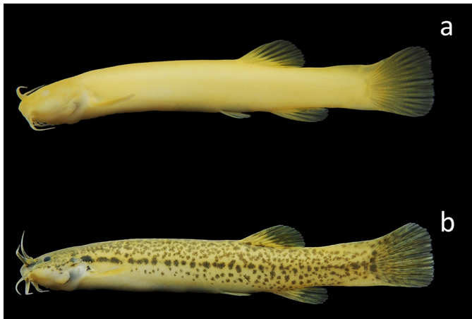
Figure 2. Cambeva guareiensis individuals shortly after preservation: (a) complete albino (28.3 mm SL) and (b) normal color pattern (30.1 mm SL) (DZSJRP 23090).