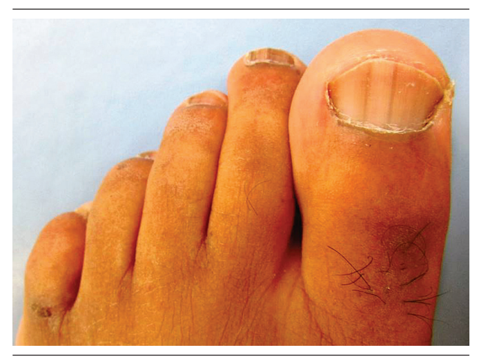
FIGURE 4 - Longitudinal brownish bands in patient's toenails