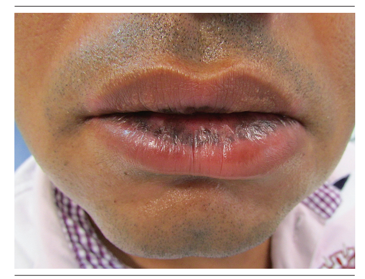
FIGURE 1 - Brownish macules, of ill-defined borders, in lower and upper lip

hard palate ( Figure 2C ), lower and upper lip mucosa, as well as vestibular sulcus.