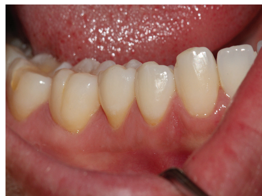
FIGURE 4 – Clinical aspect 22 months after excision of the lesion exhibiting no signs of recurrence