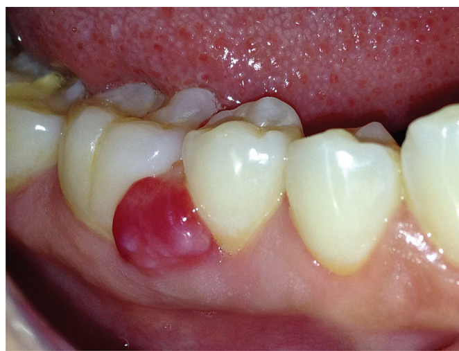
FIGURE 1 – Reddish, sessile mass in the right vestibular mandibular gingiva between the second premolar and the first molar

In July 2016, a 29-year-old white woman was referred to our department for evaluation of a painless, slow-growing swelling in the gingiva that had been identified two years earlier. Her medical history was unremarkable. Intraoral examination showed a reddish, painless, sessile nodule of soft consistency in the right vestibular mandibular gingiva between the second premolar and the first molar ( Figure 1 ), which measured approximately 1.5 × 0.8 cm. Radiographic examination revealed small crestal bone loss in the region ( Figure 2 ). An excisional biopsy was performed based on the initial clinical diagnosis of pyogenic granuloma or peripheral giant cell lesion.