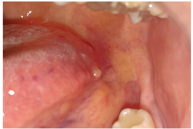
FIGURE 1 – Intraoral clinical aspect: yellowish nodular lesion, measuring 0.5 cm on the right posterior lateral border of the tongue

of OLEC was established. The patient showed no signs of recurrence after the surgical removal of the lesion.