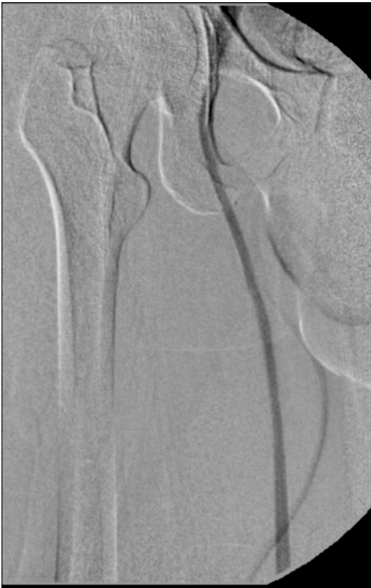
Figure 6. Ascending phlebography showing great saphenous vein and common femoral vein. The femoral vein was not observed in this segment.

Clinical presentation is variable, ranging from asymptomatic patients to cases with severe venous ulcers. 11 In the case described, the patient exhibited moderate symptoms of disease unilaterally, with edema and large caliber varicose veins.