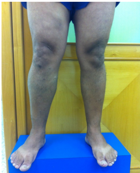
Figure 1. Lower limbs with patient standing upright, front view, showing asymmetry of right lower limb.

In many cases, diagnosis is difficult and patients remain for long periods being erroneously treated for other vascular diseases that can exhibit similar symptoms