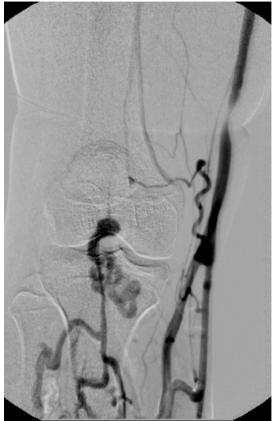
Figure 7. Ascending phlebography showing deep veins of the leg with anomalous drainage to the great saphenous vein. The popliteal vein was not visible.