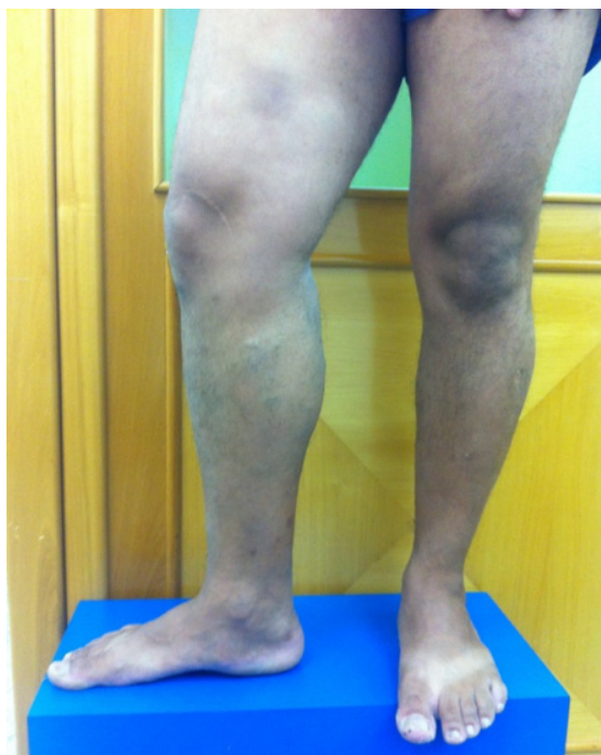
Figure 2. Lower limbs with patient standing upright, front view, showing asymmetry of right lower limb.

to anatomic anomalies. Physical examination offers the tools needed to construct a diagnosis of CVI, but is insufficient to detect the structures involved or the extent of lesions. The initial work-up examination is therefore vascular ultrasound with Doppler, as was employed in this case, offering anatomic and hemodynamic analysis of the vascular structures involved, aiding with diagnosis and differentiation of