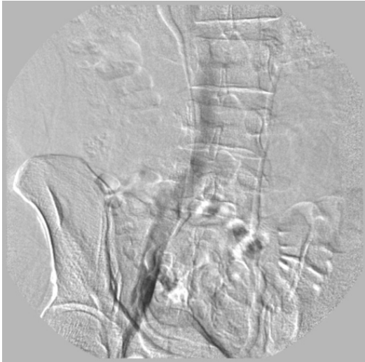
Figure 5. Ascending phlebography showing iliac vein and inferior vena cava with no abnormalities.

types of malformations. 9 In this case, the examination revealed a probable agenesis of the deep vein system in the RLL, which was later confirmed by phlebography.