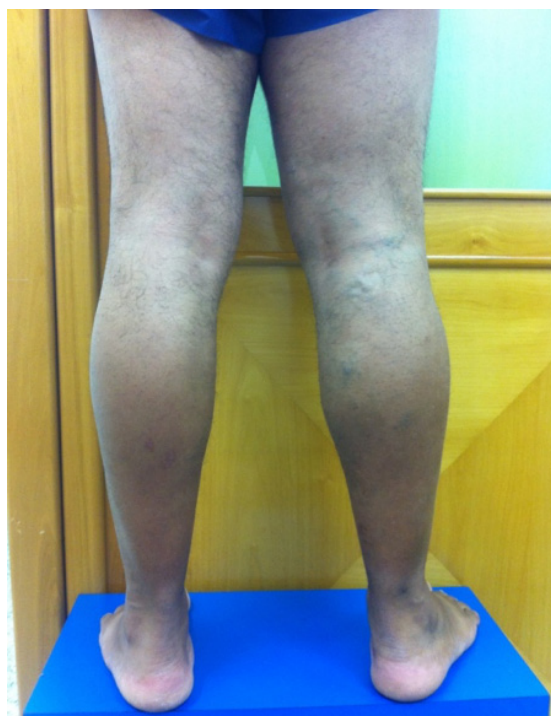
Figure 3. Lower limbs with patient standing upright, rear view, showing varicose veins in proximal leg.

to anatomic anomalies. Physical examination offers the tools needed to construct a diagnosis of CVI, but is insufficient to detect the structures involved or the extent of lesions. The initial work-up examination is therefore vascular ultrasound with Doppler, as was employed in this case, offering anatomic and hemodynamic analysis of the vascular structures involved, aiding with diagnosis and differentiation of