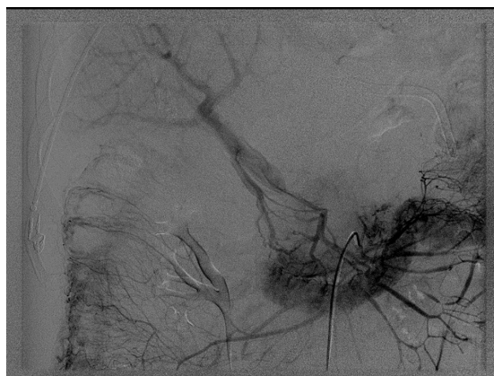
Figure 2. Splenoportography (venous phase) showing absence of venous return via the superior mesenteric and splenic veins, with drainage via collateral veins.