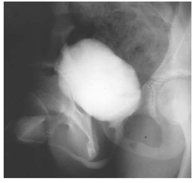
Figure 3 – Postoperative cystourethrography showing absence of vesicoureteral reflux.

in order to maintain the proper 3-5 ratio between the length of the submucous path and the ureteral diameter. Several authors had good results with the extravesical Lich-Gregoir technique for treating vesicoureteral reflux, with the well-established advantages of laparoscopy (2,3).