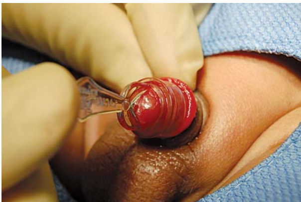
Figure 1 – Calibration of glans with Plastibell™.

Between 04/2005 and 01/2009, 130 infants underwent cultural circumcision by the modified Plastibell™ technique. Age ranged from 4 to 359 days