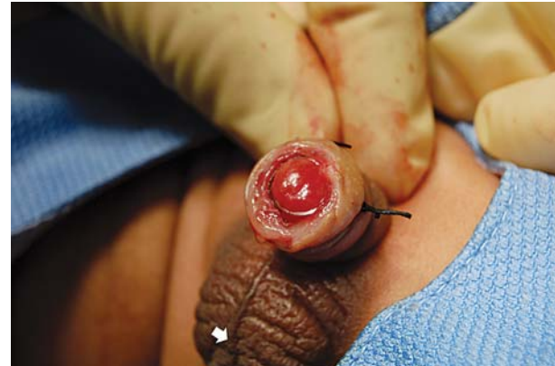
Figure 4 – Following application of a double suture, the foreskin is divided 2 mm distal to the ring.