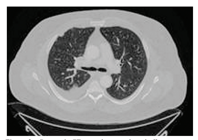
Figure 2 – Patient 1: CT scan showing pleural effusion among pleural metastasis.

The use of targeted therapy with DC vaccine after nephrectomy in metastatic RCC disease has not yet been published. It shows a possible synergy by those two approaches, leading to a more promising