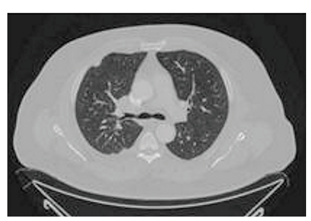
Figure 3 – Patient 1: CT scan with regression of the pleural ef fusion without thoracocentesis.