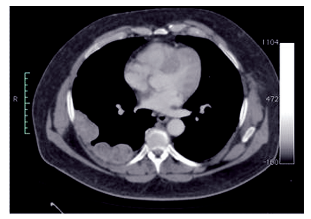
Figure 1 – Patient 1: Thoracic CT scan showing metastatic nodules.

11 months with sorafenib (12) and sunitinib (13), respectively. The use of DC vaccine has also shown promising results in some reported cases in the literature (9).