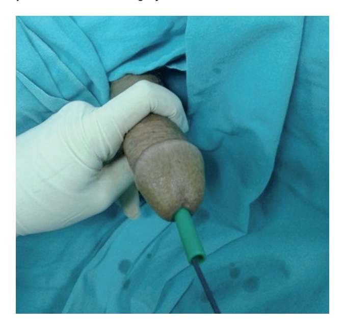
Figure 2 - Sequential dilatation is performed with amplatz renal dilators from 10F to 26F by 8F stylet over as in percutaneous renal surgery.

be possible to finalize dilatation at different levels. Amplatz dilators are advanced by rotation in direction to the bladder. The appearance of the stricture at the end of the procedure is shown in figure (Figure-3). After the dilatation, a 22F Foley catheter is placed with guidance of the guidewire. We routinely remove the Foley catheter on postoperative day 7.