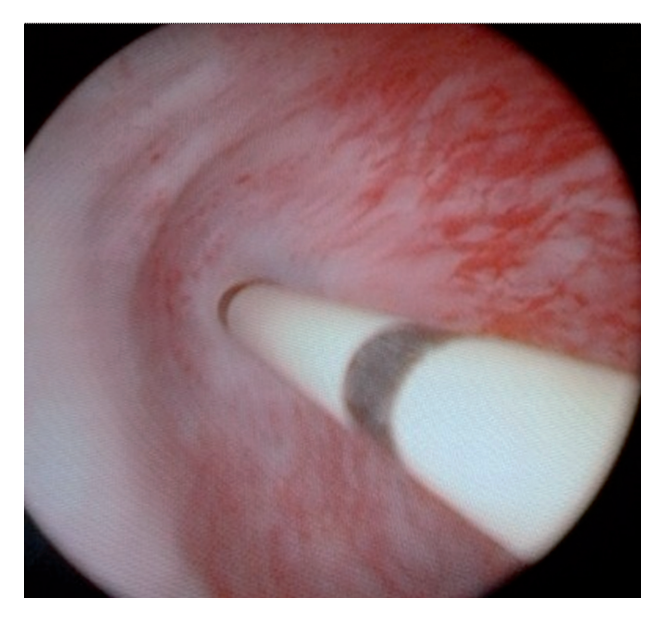
Figure 1 - A 5 French (F) open-tip ureteral catheter is manipulated through the stricture and advanced into the bladder.

ce the ureteral catheter. Sequential dilatation is performed with amplatz renal dilators from 10F to 26F by 8F stylet over as in percutaneous renal surgery (Figure-2). Amplatz dilators are usually safe to use over its 8F stylet and it may