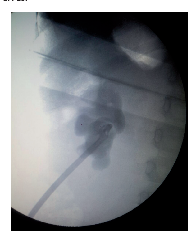
Figure 1 - Nephrostomogram showing complete blockage at PUJ.

to perform ureterocalycostomy (Figure-2) as first choice which was performed after 6 months from primary procedure.