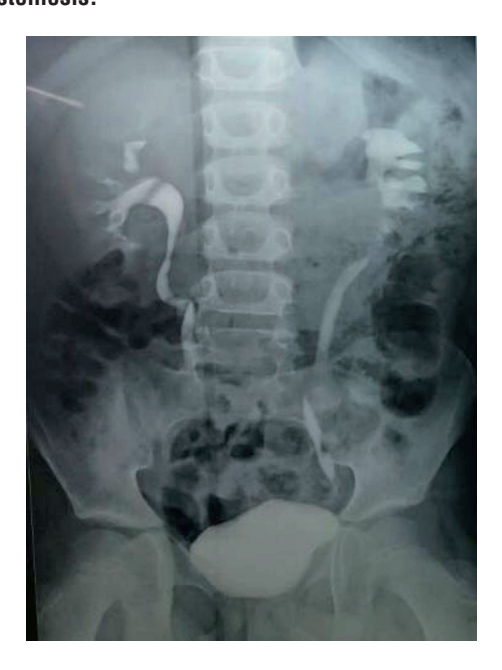
Figure 5 - Follow-up IVP-adequate drainage across anastomosis.

due to complications of kidney stone surgery or for the treatment of renal or ureteric complications of tuberculosis (7) The most frequent indication is scarring resulting from previous open surgery for stone removal or repair of PUJ obstruction (8). In many cases redo-pyeloplasty or endopyelotomy are the alternatives which can be used (9). In our cases, these options could not be used as in one case, pyelolithotomy was done for PUJ stone with total intra-renal pelvis having intraoperative disruption of PUJ, in the second case pyeloplasty and once ureterocalycostomy and in the last case due to postureteropyeloplasty for long upper ureteric stricture. Secondary PUJ stenosis following conventional pyeloplasty, open stone surgeries or endopyelotomy is complicated by peripelvic inflammation and dense fibrosis caused by urine extravasation which make them unsuitable for redo PUJ reconstruction (10).