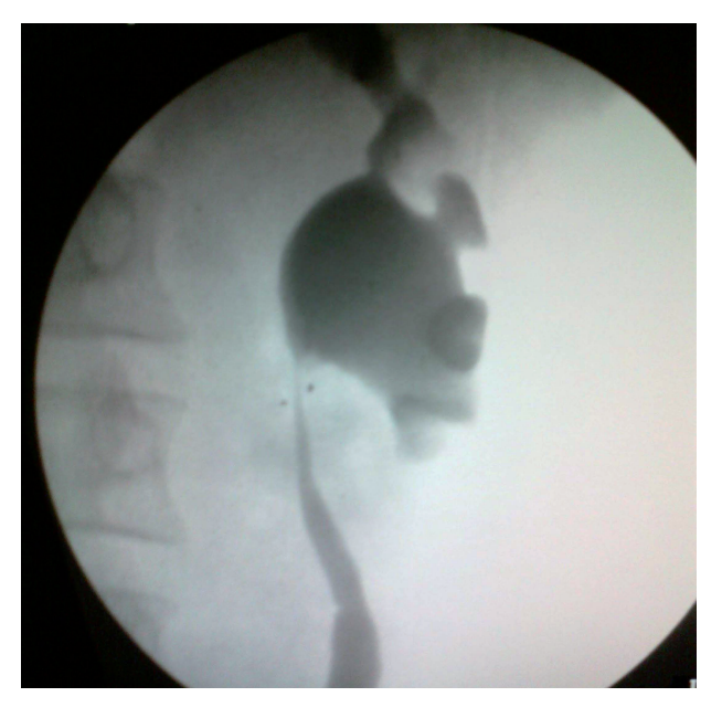
Figure 4 - RGP showing left upper ureteric stricture.

Case 3: a 23 year old female with left upper ureteric stricture secondary to tuberculosis (proved on urine AFB positive) with solitary functioning kidney. She underwent left DJ stenting and anti-tuberculous treatment. After completion of intensive phase, she underwent left ureteropyeloplasty over DJ with excision of strictured segment elsewhere 4years ago. After DJ removal at 6 weeks, she developed pain, fever and pyonephrosis for which PCN was placed and referred to us. Subsequently, she was evaluated by nephrostogram, CT IVP, and DTPA scan and found to have normal functioning obstructed left renal unit without drainage beyond anastomotic site. RGP (Figure-4) and re- DJ stenting tried but failed due to inability to pass the guide wire beyond anastomotic site suggesting anastomotic stricture. Three years ago, we did ureterocalycostomy by guillotine technique over DJ stent. Intraoperatively she had gross perianastomotic site fibrosis and anastomotic site stricture. After 6weeks, DJ was changed as RGP showed inadequate drainage. Subsequently she needed two more DJ stent changes, after which she had non obstructed drainage which was evident on last RGP-IVP.