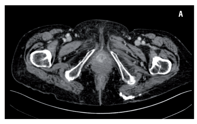
Figure 1 - Vaginal cuff recurrence in an 82 year old female. After undergoing radical cystectomy and lymphadenectomy (pT3aN0 tumor), patient subsequently developed symptomatic vaginal blood spotting. The CT scan demonstrates a solid mass originating from the vaginal cuff. Surgery was performed and final pathology showed a recurrence of urothelial carcinoma originating from the vaginal cuff.