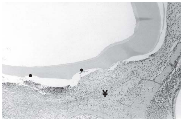
FIGURE 3 – Group I, 60 days – dense connective tissue oriented in parallel direction to the root surface (¥) and inflammatory resorption lacunae (€)

Table 2 shows the effectiveness of gallium nitrate in inhibiting replacement resorption at 15 and 30 days, since resorption was greatly increased at 60 days ( p < 0.05 ). This observation may indicate the need for placement of successive dressings, which might inhibit the occurrence of replacement resorption for a longer period.