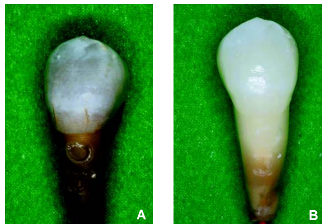
FIGURE 4- Specimen representative of group G3 after discoloration (A) and after 21 days of bleaching (B) with tetrahydrate sodium perborate