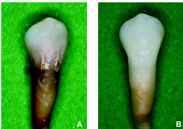
FIGURE 3- Specimen representative of group G2 after discoloration (A) and after 21 days of bleaching (B) with the mixture of 16% carbamide peroxide gel + tetrahydrate sodium perborate