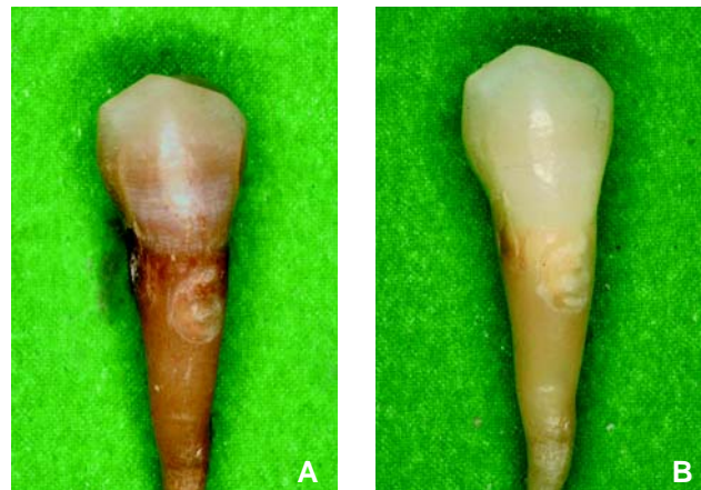
FIGURE 2- Specimen representative of group G1 after discoloration (A) and after 21 days of bleaching (B) with 16% carbamide peroxide gel