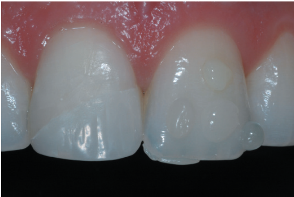
Figure 3- Shade selection performed on a clean tooth under the natural humidity, with a large combination of composite resins attempting to identify the fine shade differences at each tooth region