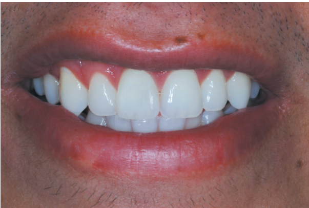
Figure 10- Final esthetic outcome