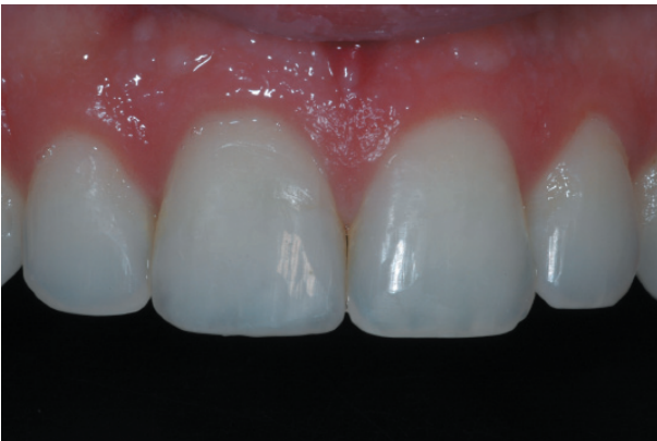
Figure 11- Follow-up at 12 months