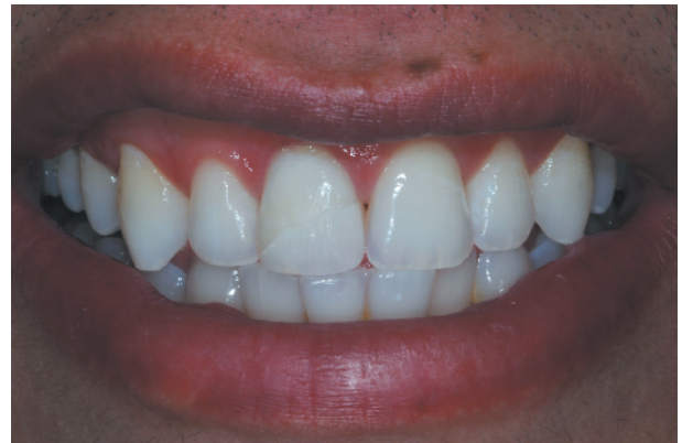
Figure 1- Initial case, showing inadequate reproduction of the polychromatic aspects of tooth

A common mistake in color selection step is to use ceramic shade guides. These are not indicated because their use is specific for prosthetic pieces and they are fabricated from materials that differ completely from composite resins. In addition, it is difficult that the color selected in the ceramic shade guide present any similarity to the corresponding resin color that will be used in the restoration