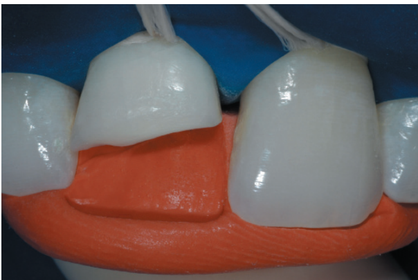
Figure 4- Artificial palatal enamel made using a silicon personalized guide