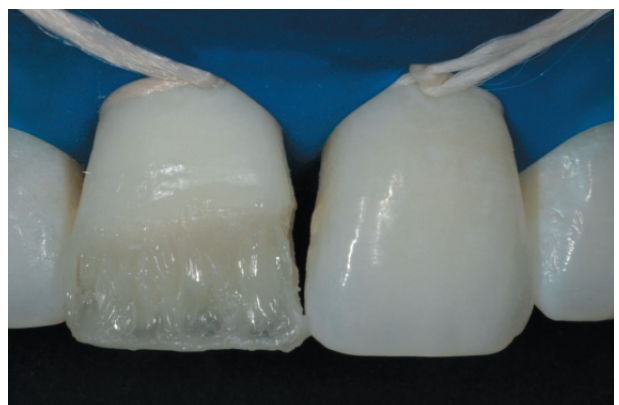
Figure 8- Application of Amaris® TL+high opaque to mimic the effect of opalescent halo. Amaris® HT was inserted to reproduce the incisal translucency

in order to achieve the harmonious and natural aspect of the restoration. When reproducing the artificial dentin localized in the inner part of the restoration and directed to the cervical third, the chrome should be increased in one number (Figure 6). This resin must present a high-chrome shade in order to simulate the optical properties of the tooth.