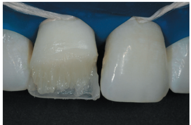
Figure 7- Application of Amaris® O1 to reproduce a more superficial dentin