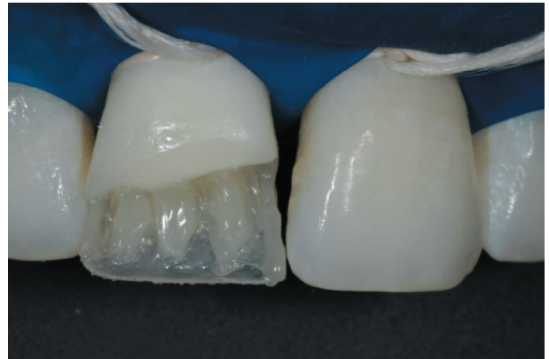
Figure 6- Reproduction of the deepest artificial dentin with more opaque characteristics

In natural teeth, there is a progressive decrease in chrome from the cervical to the incisal area, as well as from the most internal towards the surface of the tooth 17 . These differences should be reproduced