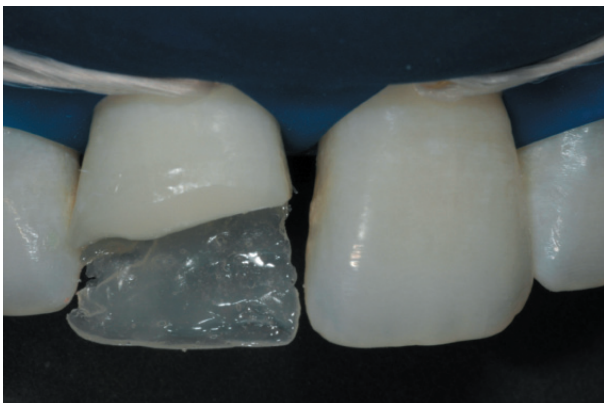
Figure 5- Application of translucent resin to reproduce the palatal portion of the tooth. Note the translucency achieved by Amaris® TL, ideal to reproduce the enamel that was lost