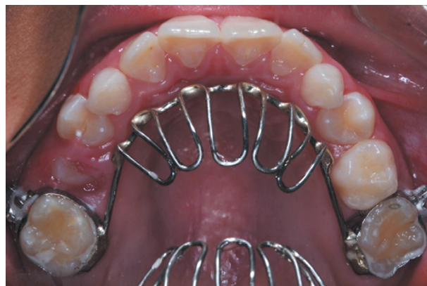
Figure 2- Fixed palatal crib