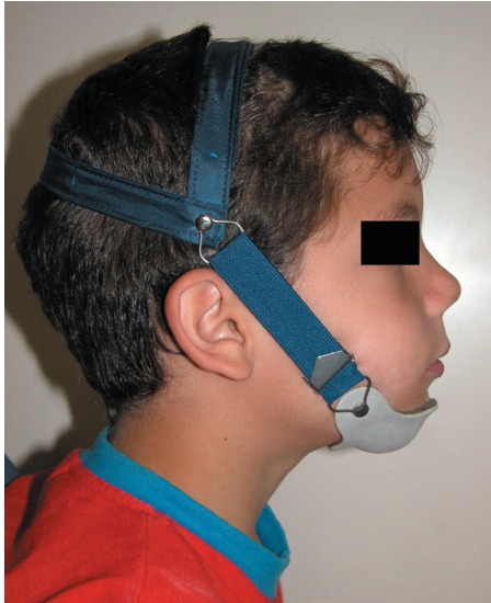
Figure 3- Chincup with the force vector directed to the condyle

study was approved by the University of São Paulo, Bauru School of Dentistry Institutional Review Board (Protocol number 14/2007). All subjects and their parents read and provided written informed consent after demonstrating full understanding of the purpose of this study.