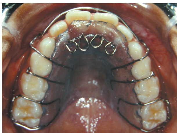
Figure 1- Removable palatal crib

The sample of this prospective study was composed of 60 children selected according the following inclusion criteria: Brazilian Caucasian children, age ranging from 7-10 years, intertransitional mixed dentition period, open bite greater than 1 mm, incisors and first permanent molars fully erupted, and Class I relationship. It were excluded patients previously orthodontically treated, with severe crowding (more than 4 mm), with teeth absences and patients with TMJ trauma or disorder. This