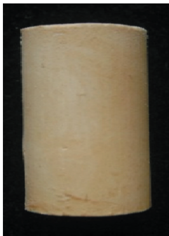
Figure 2- Sample used for compressive strength test