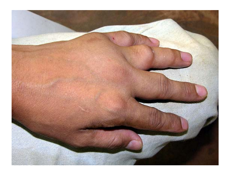
Figure 3: Maximum swelling of the left hand and fingers photographed 130 min after the bite (Case 1).