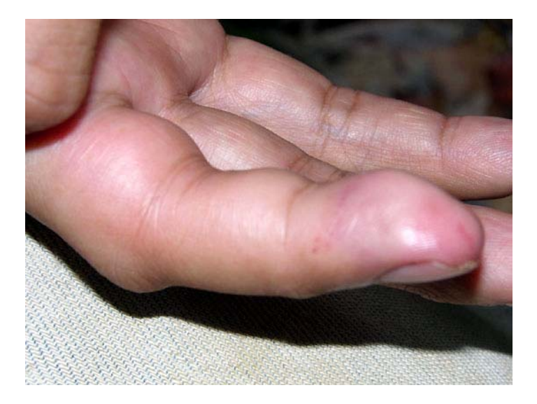
Figure 2: Swelled left ring finger photographed 45 min after the bite (Case 1).

Figure 1: Beginning of swelling 12 min after the bite by Ithycyphus miniatus (Case 1). The enlarged posterior maxillary teeth of the snake were embedded into the ventral surface of the distal segment of the left ring finger for 60 s during the bite.