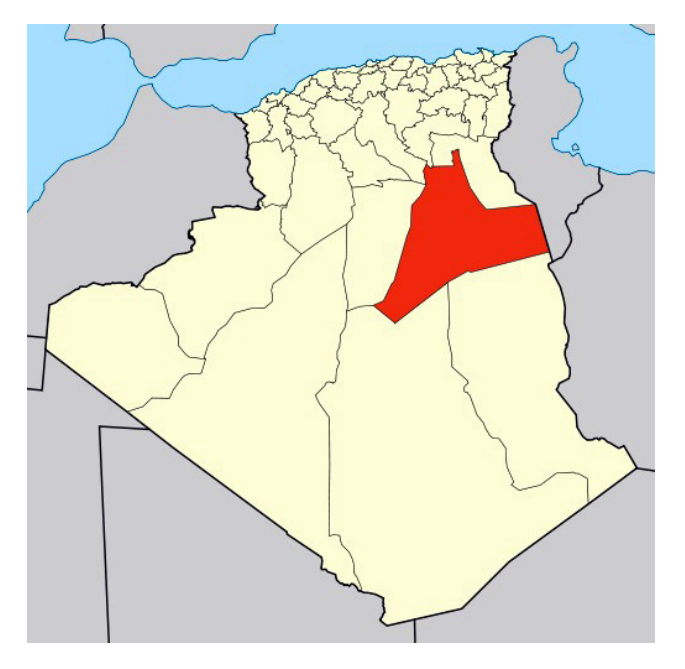
Figure 2. Location of the province of Ouargla in Algeria.

All patients presented disorders of myocardiac kinetics, presenting a shape resembling a myocardial akinesia or hypokinesia, mostly septal or anterior (Table 1), which, in five cases, affected the entire myocardium.