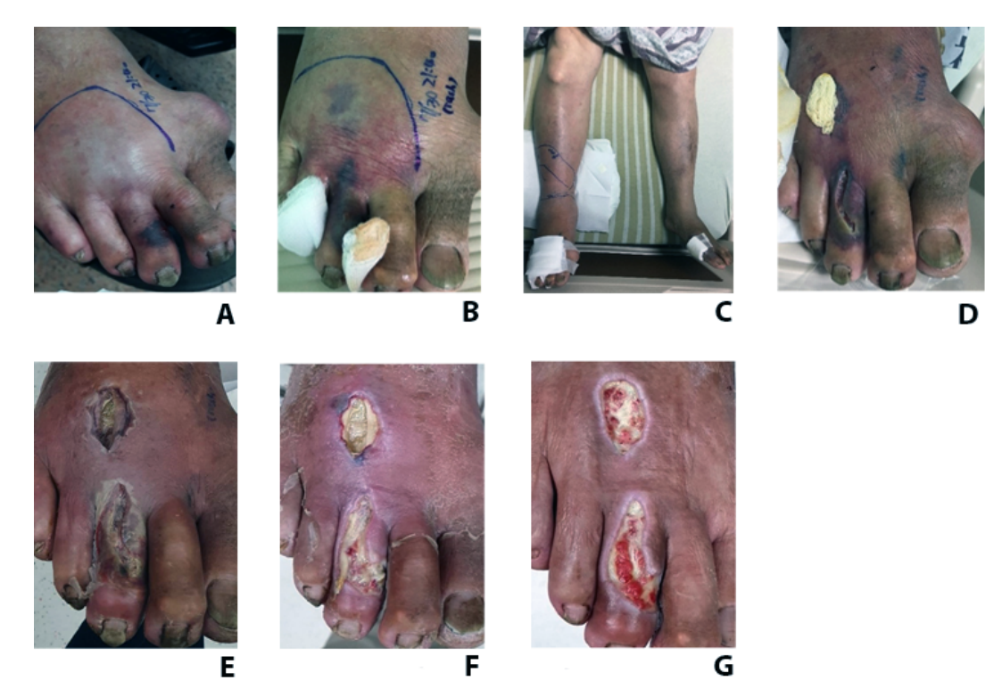
Figure 2. The evolution of wounds in a late debridement case. (A) A 66-year-old man was bitten by a cobra on the right 2^{nd} and 3^{rd} toes with necrotic signs within one hour of snakebite. (B) The necrotic lesion was observed on the right foot 17 hours later. (C) Limb swelling reached the right leg three days later. (D) Wound incision and minimal debridement. (E, F) Wound condition in one week, one month and two months.