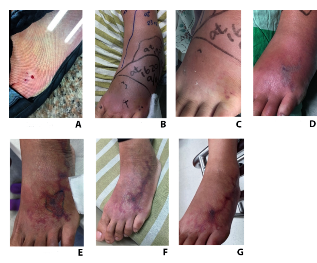
Figure 1. The evolution of a wound that did not undergo debridement. (A) A 46-year-old woman was bitten by a cobra on the left 5<sup>th</sup> toe, presenting pain and foot swelling. (B, C) After six hours, red to violaceous reticular patches with some central necrotic tissue were present. (D, E) Progressive limb swelling with tissue necrosis on day 7 and day 10. (F, G) Wound condition on day 17 and day 30.