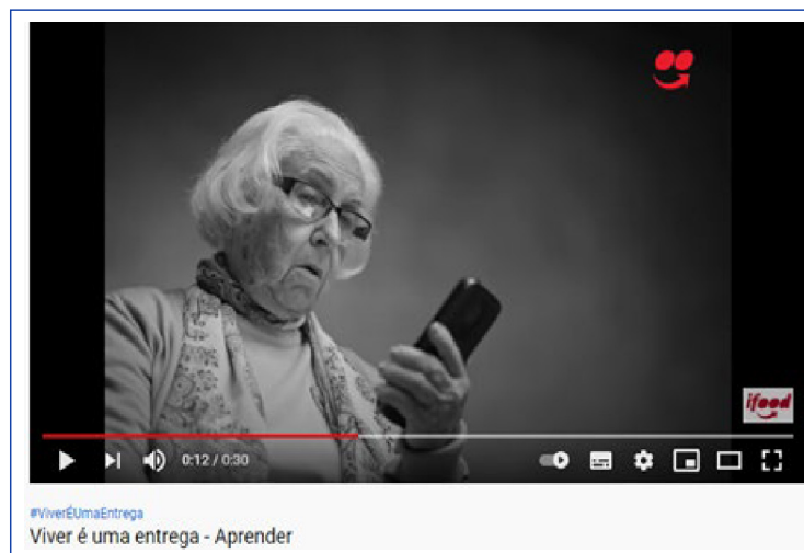
Figure 4 Food marketing campaign targeting elderly consumers further encourages them to use the app. Campaign broadcasted on Youtube and television