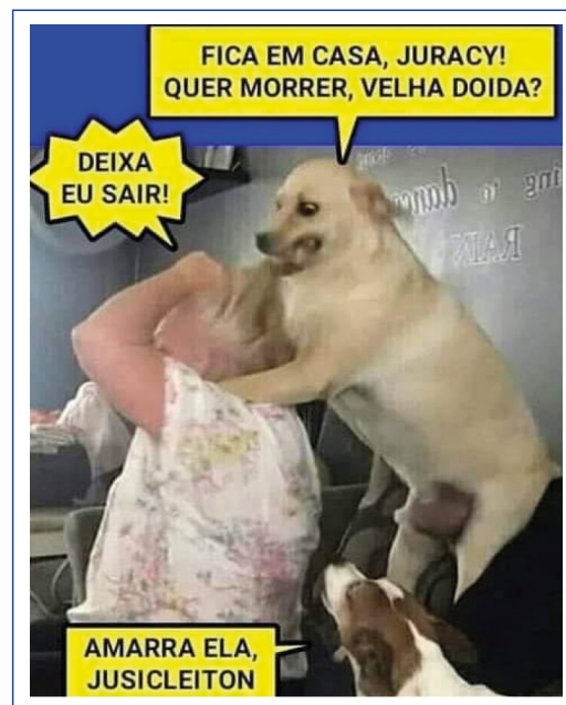
Figure 2 Meme about elderly in the pandemic

Similarly, although intended to entertain those who consume them, memes collected throughout this research picture the elderly in a condition of forced confinement induced by others. Such cultural artifacts (memes) disregard elderlies' conquered independence. For example, figure 1 shows a lady being prevented from going out by her dog, who says: 'Stay at home. Do you want to die, crazy old woman?'. Such text reveals a fragile autonomy, which suspension can occur at any socially authorized moment, and exposes the elderly vulnerable condition under the gaze of others.