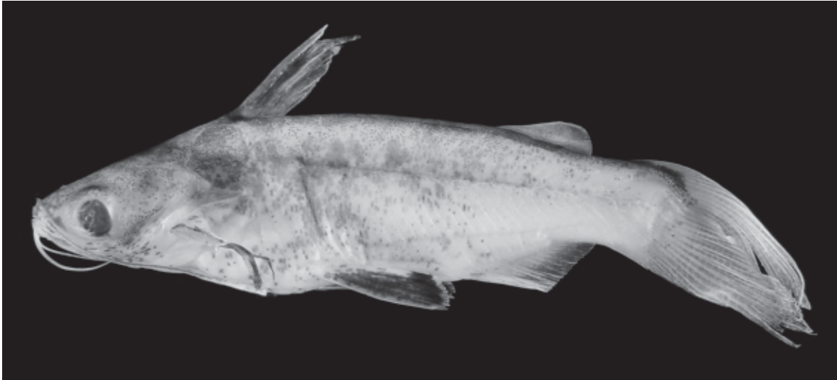
Fig. 2. Entomocorus melaphareus , paratype, MZUSP 76445, 43.1 mm SL.

trated dark pigment on most of interradian membranes. Unbranched fin ray with little pigmentation, appearing pale in contrast to remainder of fin; pigmentation on all but posterior most portion of fin; pigmentation somewhat more concentrated basally. Barbels with scattered dark pigmentation, appearing pale or dusky.