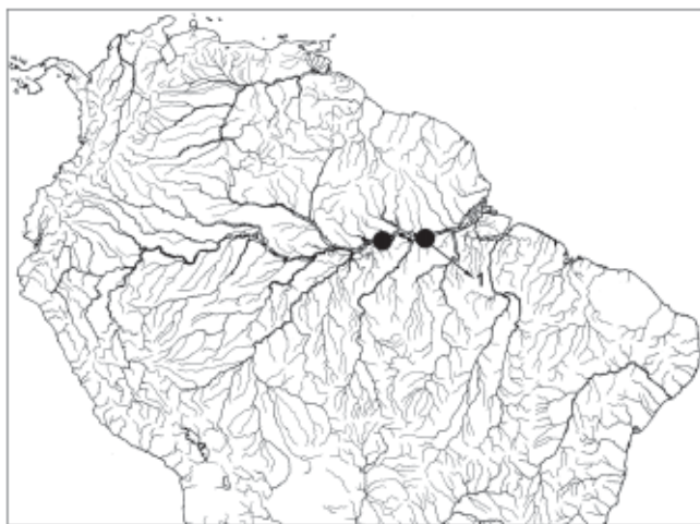
Fig 3. Distribution of Entomocorus melaphareus . Type locality is indicated by the number 1.

The new species is more similar in coloration to Entomocorus benjamini than it is to E. gameroi . Entomocorus melaphareus and E. benjamini share similar marking on the caudal fin, in which the upper lobe has an indistinct blotch of dark pigment and the caudal-fin base has a diffuse vertical bar. In contrast, E. gameroi has a broad, nearly horizontal stripe of dark pigmentation that extends from the base to the