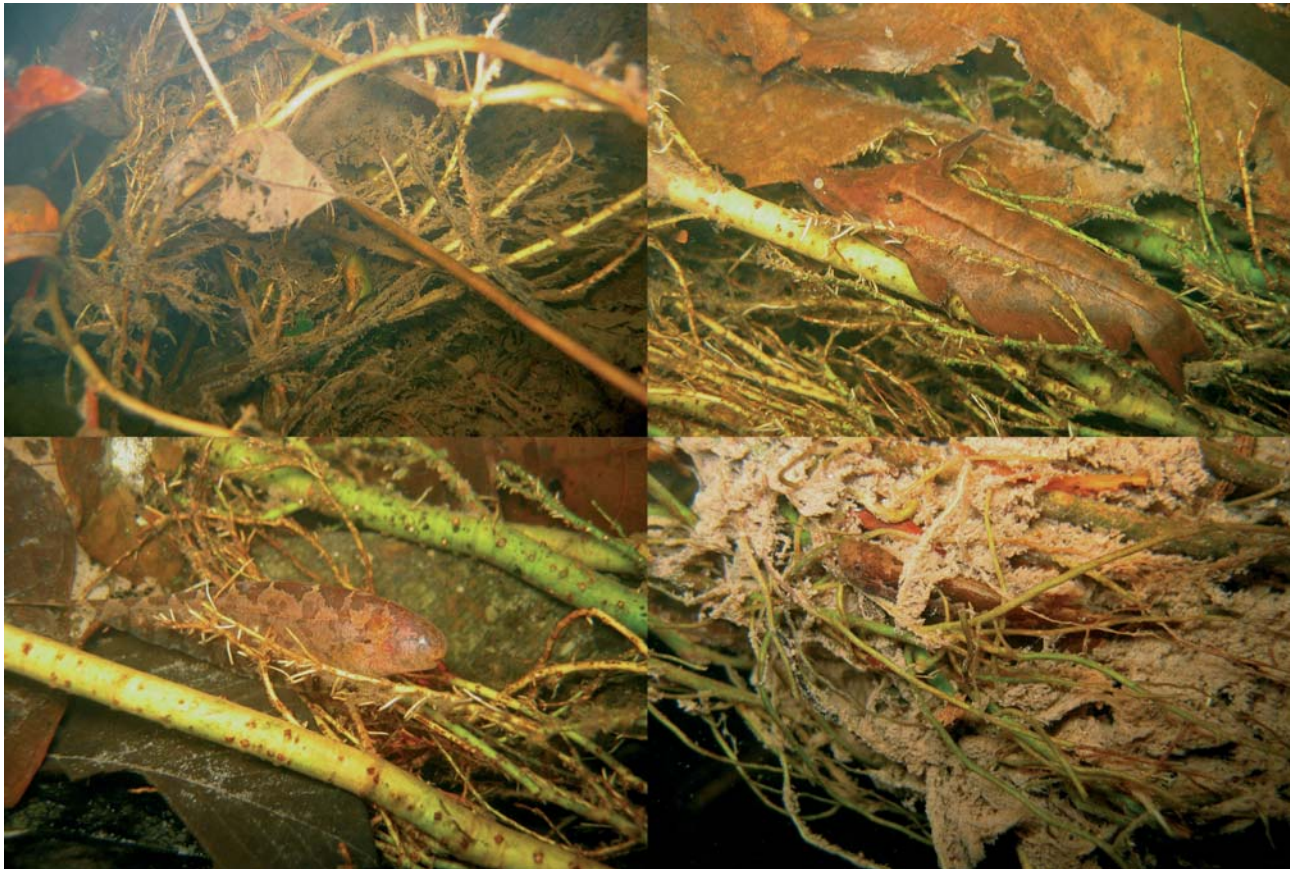
Fig. 1. Habitat and aspect of three root-tangle and leaf-litter inhabiting fish species photographed underwater in an Amazonian streamlet: Tetranematichthys quadrifilis (77.7 mm SL, INPA 25107, top right), Steatogenys duidae (129.22 mm TL, INPA 25018, bottom left), and Helogenes marmoratus (59.8 mm SL, INPA 25111, bottom right).

When its diurnal shelter was disturbed, T. quadrifilis left the debris and drifted like a waterlogged leaf moving slowly in the water flow, with no apparent movements of its fins. Similar but less pronounced behaviour was recorded for S.