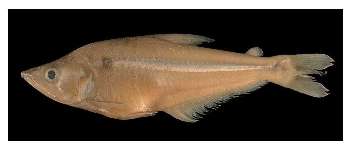
Fig. 2. Galeocharax goeldii, UNIR 0008, 123 mm SL, igarapé do Arara, rio Madeira, Porto Velho, Rondônia.

row of conical teeth which 4 anteriormost spaced and first, third and fourth larger than second, these followed by posterior row of 15-31 (18), 20.1, close-set conical teeth that show tendency to increase in number according to increase in standard length (Fig. 3). An inner row of 7-11 (7), 9 conical dentary teeth.