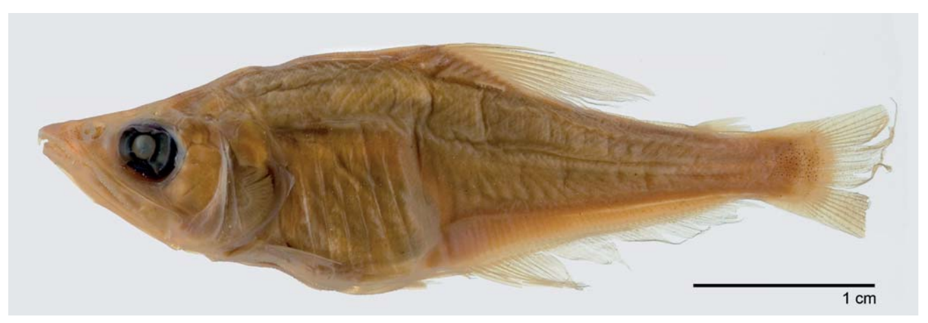
Fig. 1. Galeocharax goeldii, ANSP 39308, holotype, 44.3 mm SL, tributary of Madeira River near Porto Velho, Brazil.

Diagnosis. Among the species presently assigned to Galeocharax , G. goeldii is most similar to G. gulo and G. knerii with respect to most meristic characters, with exception of the number of perforated lateral line scales (87-95 in G. goeldii vs 80-86 in G. gulo and G. knerii ). It differs from G. humeralis by having fewer perforated lateral line scales (87-95 vs 98-101 in G. humeralis ), fewer horizontal scale rows from dorsal-fin origin to lateral line(17-18 vs 20-22 in G. humeralis ) and fewer maxillary teeth (35-45 vs 47-52 in G. humeralis ).