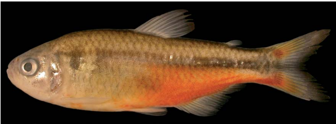
Fig. 1. Hyphessobrycon vinaceus , MCP 40916, holotype, male, 56.5 mm SL; Brazil, Minas Gerais, São João do Paraíso, rio São João, tributary of upper rio Pardo.

Premaxilla with two tooth rows; outer row with 2-4, tricuspid or pentacuspoid teeth with central cusp longer; inner row 5 (one with 4) teeth with 5-7 cusps and central cusp longer and broader than other cusps, inner row teeth gradually decreasing in length from first to fourth teeth, last tooth considerably smaller. Two to three maxillary teeth, with 5 cusps, central