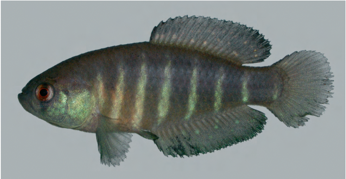
Fig. 1. Austrolebias paucisquama , holotype, MCP 41879, male, 34.2 mm SL, Rio Grande do Sul, São Sepé, temporary pool close to BR290 highway (30°22'27" S 53°33'42" W), rio Vacacaí drainage.