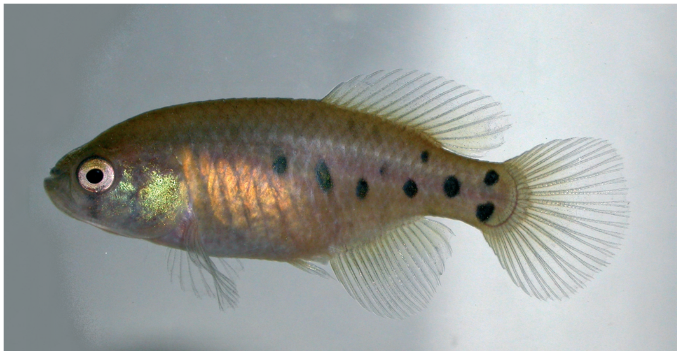
Fig. 3. Austrolebias paucisquama , paratype, MCP 41880, female 32.6 mm SL, Rio Grande do Sul, São Sepé, temporary pool close to BR290 highway (30°22'27"S 53°33'42"W), rio Vacacaí drainage.

from other species of the genus Austrolebias , except from those of the A. alexandri species-group. The fewer scales around caudal peduncle (12 vs. 16 or more) and the fewer dorsal-fin rays in males (17-21 vs. 20 or more in A. litzi and A. nigripinnis ; 21 or more in A. affinis , A. alexandri , A. cyaneus , A. juanlangi and A. luzardo ; 22 or more in A. duraznensis , A. ibicuiensis , A. paranaensis , A. periodicus ) distinguish A. paucisquama from other species of the A. alexandri species-group. The lack of contact organs on the inner surface of the pectoral fin in males and the color pattern of females – ground