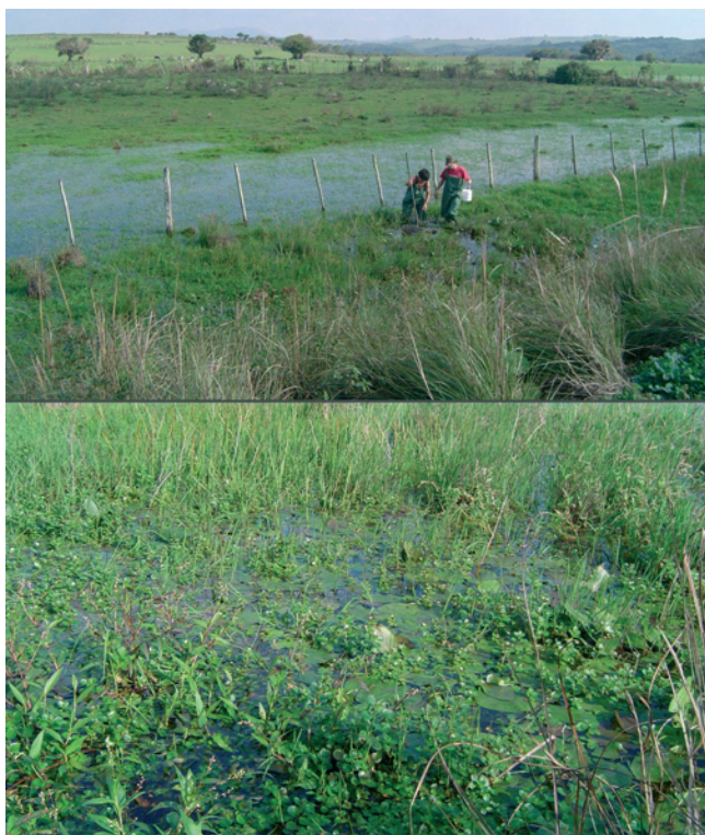
Fig. 5. Temporary pool close to BR290 highway (30°22'27"S 53°33'42"W), type locality of Austrolebias paucisquama (above) and detailed image of the vegetation coverage.

fishes collected in two collecting efforts in September 2004 and June 2005, corresponding to winter and autumn in the southern hemisphere. Maximum depth observed was 50 cm. The environment was almost completely covered with emergent vegetation, serving as cattle pasture.