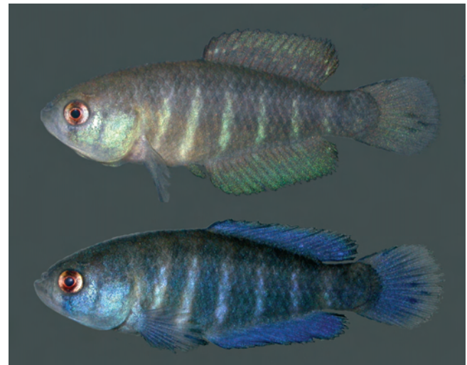
Fig. 2. Austrolebias paucisquama , paratype, MCP 41880, male 25.5 mm SL, Rio Grande do Sul, São Sepé, temporary pool close to BR290 highway (30°22'27" S, 53°33'42" W), rio Vacacaí drainage. Same specimen alive (above) and just after fixation in formalin (below).

Diagnosis. The dark gray pectoral fins combined with the bright blue iridescence in males distinguishes A. paucisquama