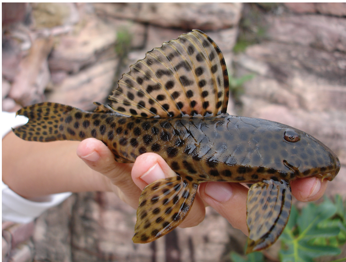
Fig. 2. Hypostomus jaguar , paratype, UFBA 6457, 170.2 mm SL. Photographed alive.

unae by having conspicuous dots on head, trunk, and fins similar in size ( vs. dots on lateral of trunk inconspicuous and, when visible, much larger than those on the head and fins), pectoral spine not distinctly strong with a few elongated odontodes on its distal third ( vs. pectoral spine distinctly strong with many elongated and curved odontodes on its distal half); longer dorsal fin, with tip of last ray, usually reaching preadipose plate or adipose spine when adpressed (adpressed fin 36.6-44.3% vs. 29.6-38.7% and tip of last rays not reaching adipose plate or spine), and more teeth on premaxilla (47-86, mode 70) and dentary (50-81, mode 75) ( vs. 29-70 [mode 51] on premaxilla and 34-89 [mode 54] on dentary). Additionally, H. jaguar can be distinguished from its congeners from coastal northeastern rivers ( H. carvalhoi , H. eptingi , H. jaguribensis , H. nudiventris , H. papariae , and H. pusarum ) by a series of features, including the dark conspicuous dotted color pattern of the body and fins, ventral surface of the belly comparatively weakly covered by plates, and lobes of the caudal fin relatively similarly elongated. See 'Remarks' for additional evidence for the recognition of the new species.