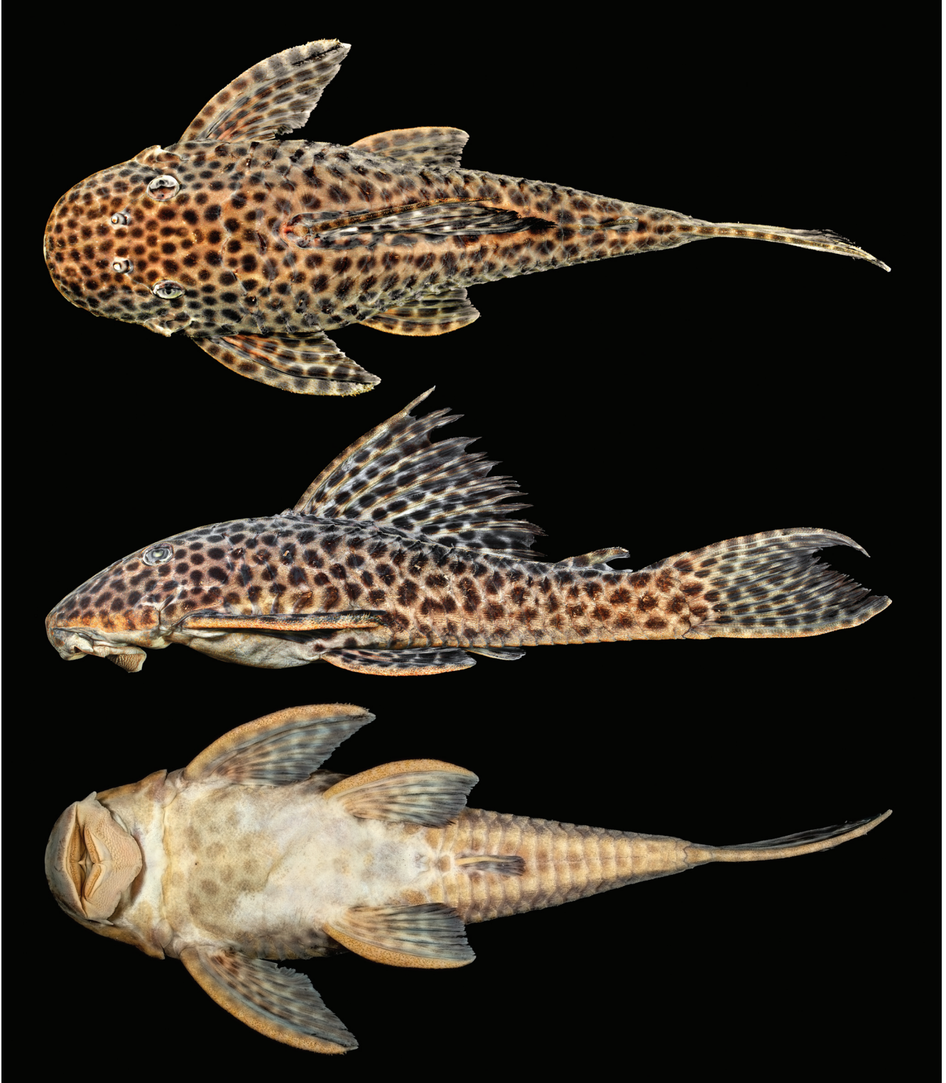
Fig. 1. Hypostomus jaguar , holotype, MZUSP 110603, 164.8 mm SL, from the rio Paraguaçu, Bahia State, Brazil.

weakly covered by plates, with coverage when present restricted to anterior portion of abdomen ( vs. ventral surface almost or completely covered by plates, including the central area between pelvic fins). The new species differs from H.