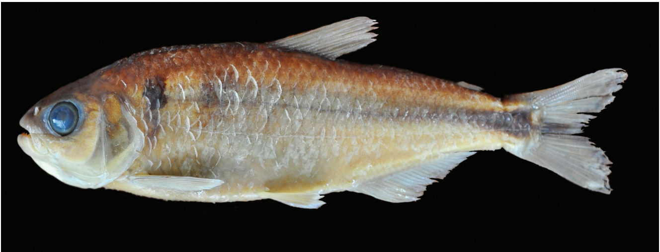
Fig. 1. Astyanax guaricana , holotype, MZUSP 112224, 95.6 mm SL, Brazil, Paraná State, rio Arraial, 25°42'29"S 48°58'25"W, at Reservoir of Guaricana Dam affluent of the rio Cubatão, coastal basin.

vertical anterior to orbit, slightly curved and forming an angle of approximately 45° relative to longitudinal axis of body. Anterior region of maxillary bone forming an angle around 90° with premaxillary bone, when mouth opened. Posteroventral margin of the third infraorbital close to the preoperculum, leaving small bare area between edge of these bones.