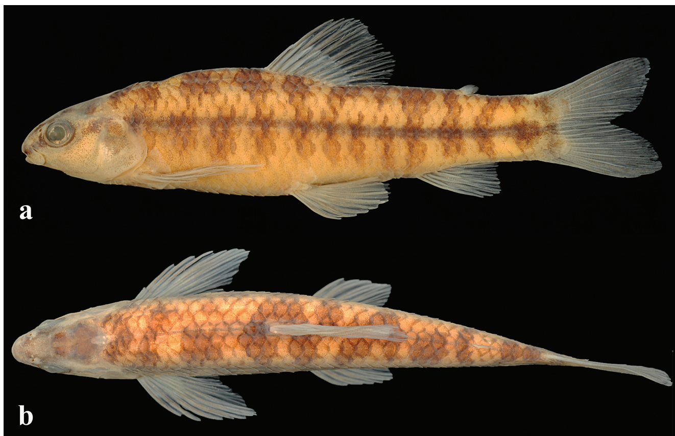
Fig. 5. Characidium deludens , holotype, MZUSP 115009, 48.3 mm SL, female, Brazil, Bahia, Piatã, rio Cochó, tributary of upper rio Paraguaçu basin: (a) lateral and (b) dorsal views.

Dorsal-fin rays ii,9*(30); distal margin of dorsal fin slightly rounded. Adipose fin present. Pectoral-fin rays highly variable iii,6,ii(2), iii,6,iii(6), iii,7,i*(1), iii,7,ii(5), iii,8,1(7), iii,8ii(1), iii,9,i(3), iv,7,i(1) or iv,8,i(1); 1 st and 2 nd branched pectoral-fin rays longest; posterior tip of pectoral fin not reaching pelvic-fin insertion. Pelvic-fin rays i,6,ii(3), i,7,i*(26), or i,7,ii(1); 2 nd to 4 th branched pelvic-fin rays longest; posterior tip of pelvic fin usually not reaching anal-fin origin. Anal-fin rays ii,6(1) or ii,7*(28); posterior margin of anal fin straight or slightly rounded. Caudal-fin rays i,9,8,i*(26). Dorsal procurrent caudal-fin rays 8(1); ventral procurrent caudal-fin rays 7(1).