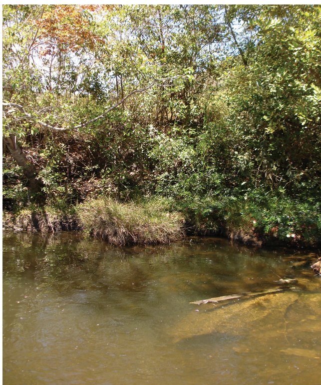
Fig. 7. Type locality of Characidium deludens , Bahia, Piatã, rio Cochó, upper rio Paraguaçu basin.

Habitat and ecological notes. The rio Cochó has part of its headwaters in Piatã, around 1,200 m above sea level, and runs on the eastern slopes of the Serra do Sincorá, on the west side of the Chapada Diamantina National Park. Included in the Cerrado-Caatinga ecotone, the area of the rio Cochó is dominated by Cerrado vegetation, usually composed of scattered small trees, shrubs and grasses. The stretch of the rio Cochó sampled is 5-10 m wide, up to one m deep, characterized by relatively slow water current and clear water running over portions of rocky bed alternating with sandy substrate (Fig. 7). The river is perennial in Piatã, but may become intermittent in several sections downstream, suffering considerable impact along its course due to frequent burning cycles of native vegetation, impoundment of the river associated with irrigation, and use of pesticides for coffee, sugar cane and fruit farming (Rocha, 2002). The stretch sampled in the rio Santo Antônio is around 7 m wide, a few centimeters to 1.5 m deep, surrounded by trees and shrubs, and with clear water running on sandy bottom with rocks and pebbles. The analysis of stomach contents of two specimens of C. deludens revealed the presence of allochthonous and autochthonous items, composed by fragments of vascular plants, organic debris, insect aquatic larvae and shelters (Trichoptera: Hydroptilidae), Crustacea, and fragments of unidentified arthropods.