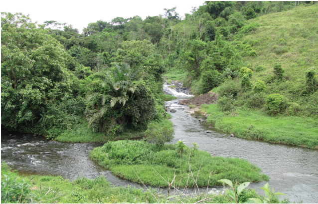
Fig. 4. Type locality of Characidium kamakan , Bahia, Camacan, rio Panelão, lower rio Pardo basin.