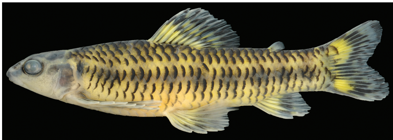
Fig. 1. Characidium kamakan , holotype, MZUSP 115000, 51.9 mm SL, Brazil, Bahia, Camacan, rio Panelão, tributary of lower rio Pardo basin.

Diagnosis. Characidium kamakan can be readily distinguished from all congeners by its unique color pattern, with distinct black borders of scales forming short vertical traces on body. The new species is further distinguished from other congeners, except C. alipioi Travassos, C. boavistae Steindachner, C. crandellii Steindachner, C. declivirostre Steindachner, C. gomesi Travassos, C. grajahuensis Travassos, C. japyhybense Travassos, C. lauroi Travassos, C. macrolepidotum (Peters), C. oiticicai Travassos, C. pterostictum Gomes, C. schubarti Travassos, C. timbuiense Travassos, C. vidali Travassos, and members of the C. fasciatum Reinhardt clade, by lacking scales on isthmus. Characidium kamakan further differs from these congeners by the absence of conspicuous vertically elongated bars or blotches on body (vs. presence in C. alipioi , C. declivirostre , C. fasciatum , C. gomesi , C. grajahuensis , C. lauroi , C. oiticicai , C. timbuiense , and C. vidali ), presence of a conspicuous black blotch at midlength of caudal-fin rays shaped like a 3 and unpigmented rounded