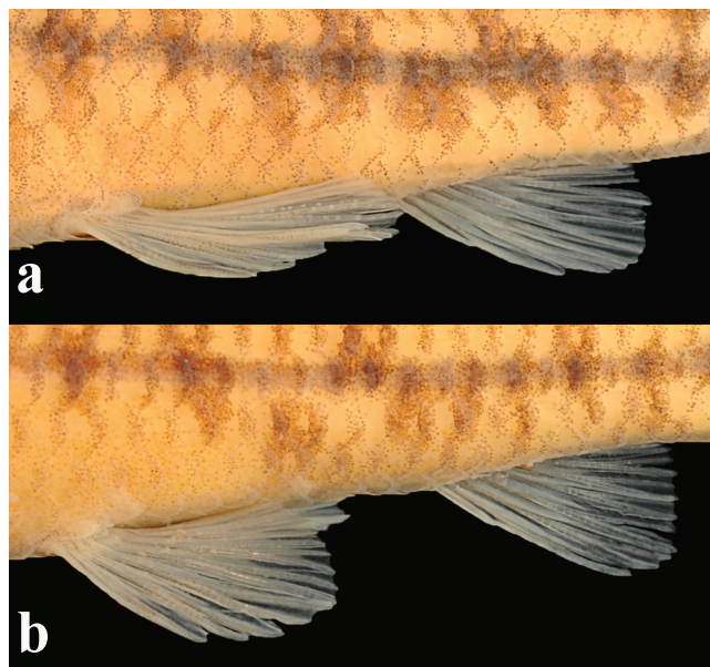
Fig. 6. Pelvic and anal fins of Characidium deludens , paratypes, UFBA 3850: (a) male, 35.3 mm SL, and (b) female, 36.1 mm SL.

Sexual dimorphism. Small bony hooks on pelvic fins were observed in 18 mature males of Characidium deludens , around 34.0 mm SL or larger (Fig. 6a). Well-developed hooks are distributed usually over distal half of 2 nd to 4 th branched rays but four specimens have also hooks on 1 st branched ray. In large mature males hooks are more numerous on 3 rd and 4 th rays, with around 20 hooks dorsally directed; 1 st and 2 nd with a few similar hooks. Hooks on maturing males occur in lower number and are distributed solely on distal 3 rd of pelvic rays. The mature females examined had no bony hooks on any of fins. Along with the presence of hooks, mature males have 3 rd to 5 th branched pelvic-fin rays somewhat more elongate than in females, reaching or almost reaching anal-fin origin when adpressed (Fig. 6a). Females of similar size possess a more rounded pelvic-fin border, distant from anal-fin origin when adpressed (Fig. 6b).