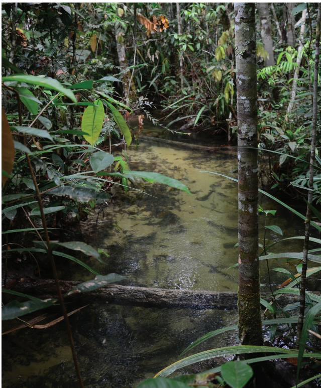
Fig. 4. Tributary of igarapé Piracolina, upper rio Machado, Vilhena, Rondônia, Brazil, type locality of Moenkhausia parecis .

Conservation status. Despite intensive and broad collecting efforts in the rio Madeira basin during 2009 to 2013 (Queiroz et al. , 2013) and recent surveys conducted in the southeastern portion of Rondônia State and northwest of Mato Grosso State undertaken in 2010-2011 and 2013-2014, Moenkhausia parecis was only collected at its type locality. Additionally, examination of several fish collections failed to reveal additional specimens. Thus, it is possible that the species is restricted to the upper rio Machado, at the Chapada dos Parecis. The type locality of M. parecis is a small forest fragment near Vilhena town that is surrounded by farms. According to the International Union for Conservation of Nature (IUCN) categories and criteria (IUCN Standards and Petitions Subcommittee, 2014), Moenkhausia parecis might be considered as ‘Vulnerable (D2)’, based on its occupation area (AOO) apparently less than 20 km 2 and the plausible future threat (agricultural development and expansion of Vilhena town around its very restricted distribution) that could lead the species to become critically endangered or extinct.