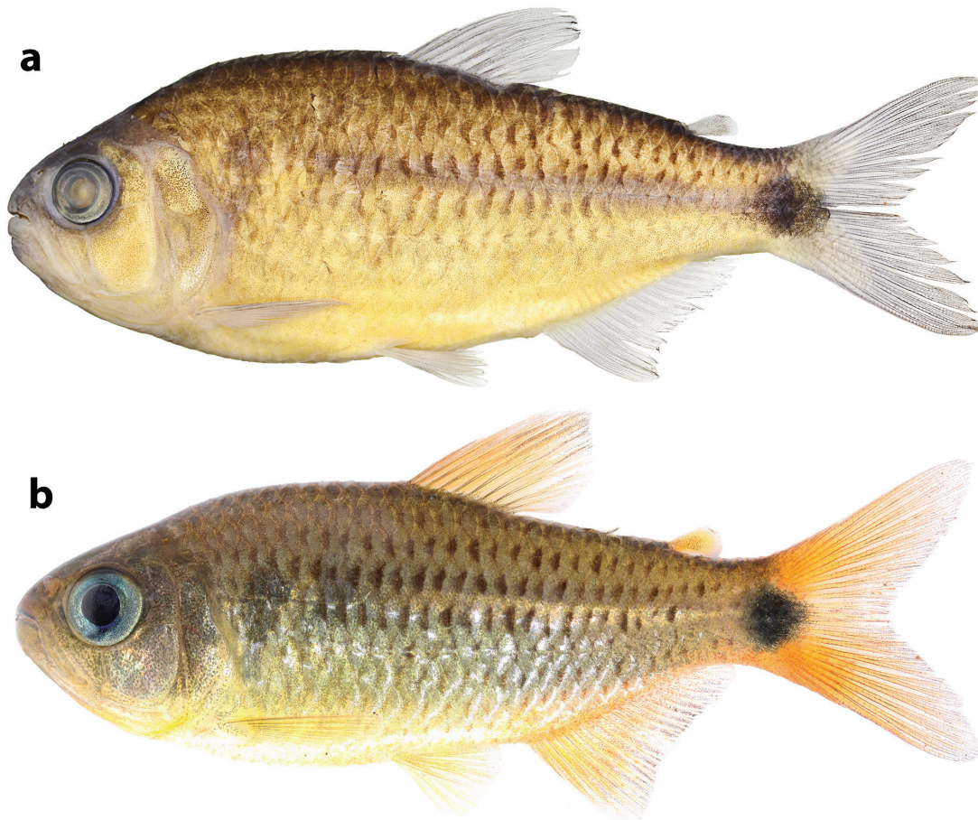
Fig. 1. Moenkhausia parecis new species, (a) holotype, MZUSP 116070, 77.9 mm SL (b) paratype, MZUSP 115509, 41.7 mm SL, immediately after capture, upper rio Machado, rio Madeira basin, Rondônia, Brazil.