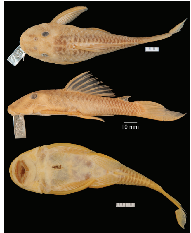
Fig. 1. Hypostomus johnii , lectotype, MCZ 7831, 94.0 mm SL, Brazil, state of Piauí, municipality of Teresina, rio Poti, tributary of rio Parnaíba. Dorsal, lateral and ventral views.

Plecostomus johnii Steindachner, 1877: 691. Type locality: rio Puty (misspelling of Poti), Teresina, Piauí, and rio Preto, Vila de Santa Rita (currently municipality of Santa Rita de Cassia), Bahia, Brazil; types (several): MCZ 7831 (1), 7863-64 (4, 2); NMW 44191-93 (2, 2, 2). -Eigenmann, Eigenmann, 1890 (revision).