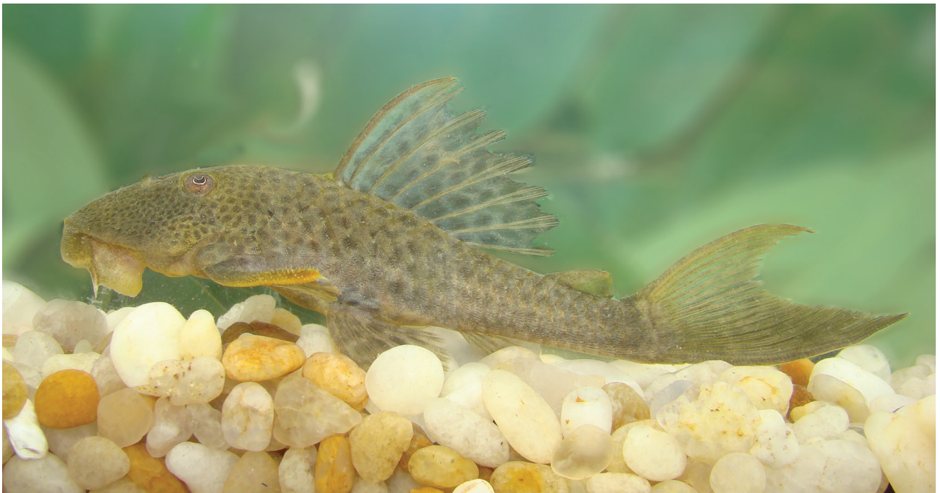
Fig. 2. Photograph of a fresh specimen of Hypostomus johnii (UFRN 1800, 116.0 mm SL) from the rio Guaribas, municipality of Picos, state of Piauí, Brazil (photographed immediately after capture).