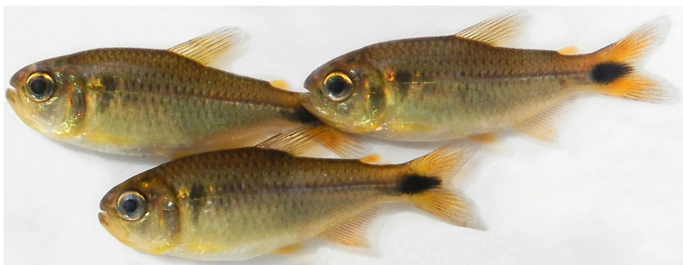
FIGURE 5 | Paratypes of Moenkhausia cambacica , MZUSP 125793, freshly collected, showing other aspects of its live coloration, Brazil, Rondônia State, Municipality of Vilhena, rio Madeira basin, upper rio Machado drainage.