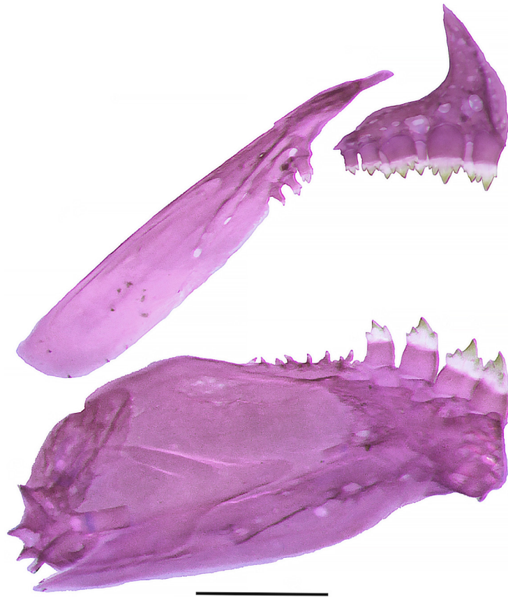
FIGURE 2 | Medial view of left side, premaxillary, maxillary, and dentary of Moenkhausia cambacica , MZUSP 125793, 27.1 mm SL, paratype. Scale bar: 1 mm.

pelvic fin reaching the anal-fin origin. Caudal-fin with i^*(26) , 9^*(26) rays on the upper and i^*(26) , 8^*(26) rays on the lower lobe. Caudal-fin forked, lobes somewhat pointed and of similar size. Twelve (1) or 13(1) dorsal procurrent caudal-fin rays and 10(2) ventral procurrent caudal-fin rays. Total vertebrae 31(2): precaudal vertebrae 16(2) and caudal vertebrae 15(2).