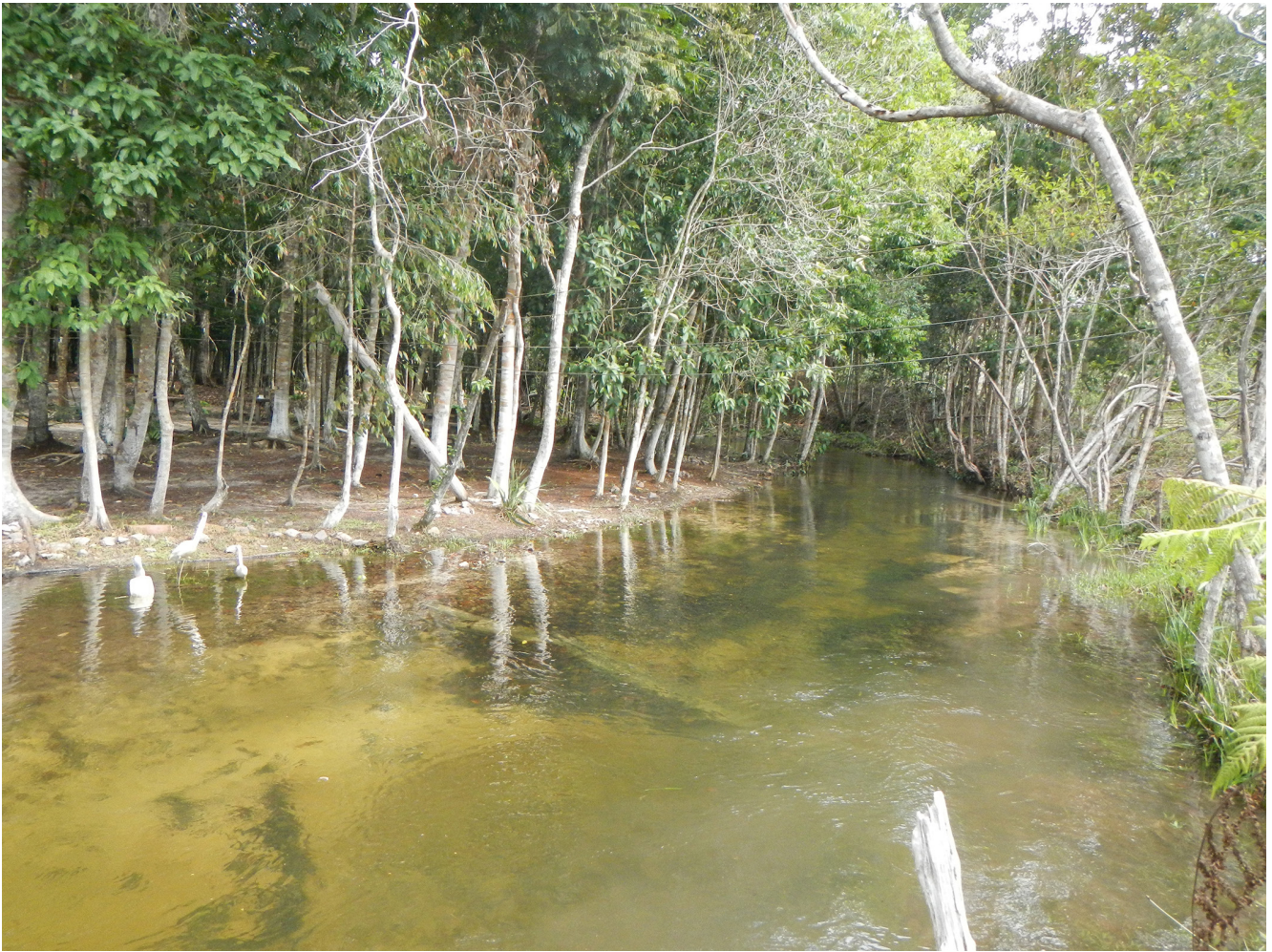
FIGURE 7 | Type-locality of Moenkhausia cambacica , tributary of igarapé Ávila, upper rio Machado, rio Madeira basin, Vilhena, Rondônia, Brazil.

Etymology. The specific name, cambacica , is after the one of the Brazilian popular name for Coereba flaveola (Linnaeus, 1758), a small neotropical bird whose coloration resembles that of the new species, which is bright yellow underparts, dark back coloration and a dark line crossing the region of the eye horizontally, contrasting with a light area above it. A noun in apposition.