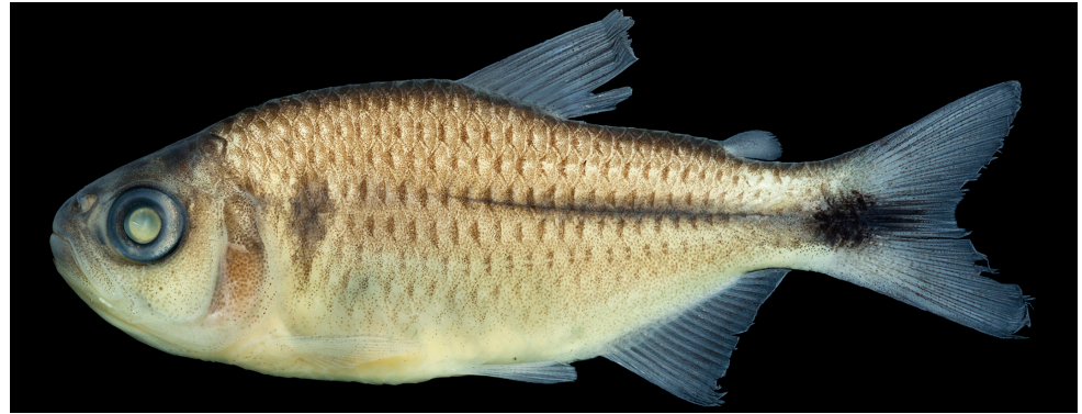
FIGURE 1 | Holotype of Moenkhausia cambacica , MZUSP 125792, 34.8 mm SL, Brazil, Rondônia State, Municipality of Vilhena, rio Madeira basin, upper rio Machado drainage.

Dorsal profile of head convex from anterior tip of upper jaw to vertical through anterior nostril. Straight or slightly convex from that point to tip of supraoccipital spine. Dorsal body profile straight or slightly convex from tip of supraoccipital spine to dorsal-fin