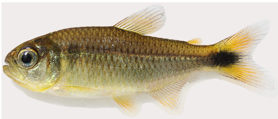
FIGURE 4 | Live coloration of Moenkhausia cambacica , paratype, MZUSP 125793, Brazil, Rondônia State, Municipality of Vilhena, rio Madeira basin, upper rio Machado drainage.

Ecological notes. The type locality of Moenkhausia cambacica is a Balneário (recreation area) upstream the Cachoeira Small Hidroelectric Dam (PCH, Pequena Central Hidrelétrica), and is located at 415 m above sea level. The stream is small, 2–4