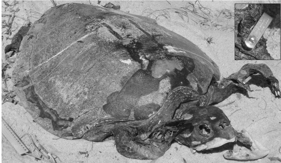
Fig. 3. Olive ridley ( Lepidochelys olivacea) carcass found in Quissamã, Rio de Janeiro state, on 17 April 2009. In detail, one of the tags on the front flippers may be seen.