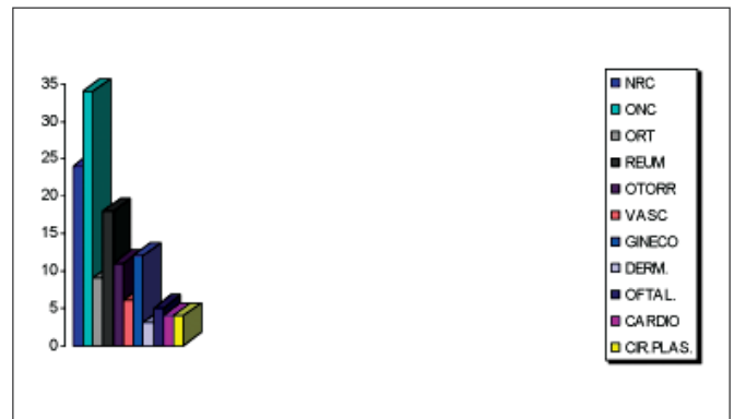
Graph 2 – Frequency of specialties referring patients to the Pain Clinic. NRC = neurocirurgia; ONC = oncologia; ORT = ortopedia; REUM = reumatologia; OTORR = otorrinolaringologia; VASC = vascular; GINECO = ginecologia; DERM. = dermatologia; OFTAL. = oftalmologia; CARDIO = cardiologia; CIR. PLAS. = cirurgia plástica.

Mean pain duration was 32.6 ± 21.9 months (median of 23 months), with minimum duration of 11 months and maximum duration of 120 months (Graph 1).