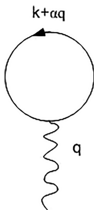
Figure 2: Tadpole diagram.

The conservation of the vector current, by the Noether