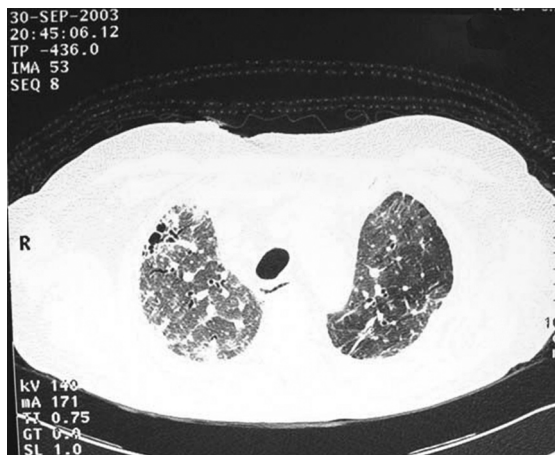
Figure 1 - High resolution computed tomography prior to the evolution to pulmonary condensation. Patchy ground-glass pattern prevailing in the right upper lobe of the native lung, with few peripheral cysts. The left lung at one month after of the transplantation.

administered postoperatively. The patient was discharged from the intensive care unit to the semi-intensive care unit. However, on the eighth day in the semi-intensive care unit, he presented exacerbation of dyspnea, accompanied by the return of the dry cough and progressive crackling rales throughout the right hemithorax, and was therefore re-admitted to the intensive care unit. The patient was again submitted to an HRCT scan. In addition, fiberoptic bronchoscopy with bronchoalveolar lavage (BAL) was performed, together with transbronchial biopsy of the left lower lobe and the right upper lobe. All cultures tested negative, the BAL fluid presented a neutrophilic pattern, without eosinophils or hemosiderin-laden macrophages, and the histopathological analysis was inconclusive. A pulmonary arteriogram was performed, followed by thoracoscopic lung biopsy in three different regions of the right upper lobe to ensure that the disease was representative (Figures 1 and 2). The pulmonary arteriogram did not demonstrate thromboembolic disease. The biopsy culture was negative for bacteria, fungi, and mycobacteria. Herpes simplex virus and cytomegalovirus tests were also negative. Direct immunofluorescence for Chlamydia pneumoniae , Legionella pneumophila , and Mycoplasma pneumoniae , as well as for antigenuria for L. pneumophila serotype 1, were negative. The histological study of the biopsy of the