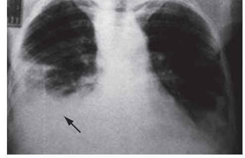
Figure 1 – Chest X-rays selected from among the cases: a) cavity with well-defined borders adjacent to the pleura in the right upper lobe; b) extensive alveolar opacity with air bronchogram in the right lower lobe; and c) alveolar opacities in the lower lobes, with pleural effusion on the right.

respectively). Four patients presented positive sputum and blood culture. In one case, fine-needle aspiration biopsy was the only elucidative diagnostic measure (Table 4). There were 23 cases (95%) of methicillin-sensitive S. aureus (MSSA) and only one case of methicillin-resistant S. aureus (MRSA),