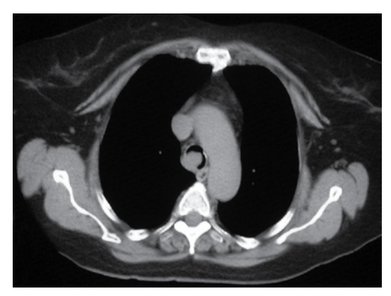
Figure 2 – CT scan of the chest showing a lesion partially occluding the tracheal lumen.

The anatomopathological study indicated a well-differentiated, low-grade MEC, without mediastinal lymph node involvement.