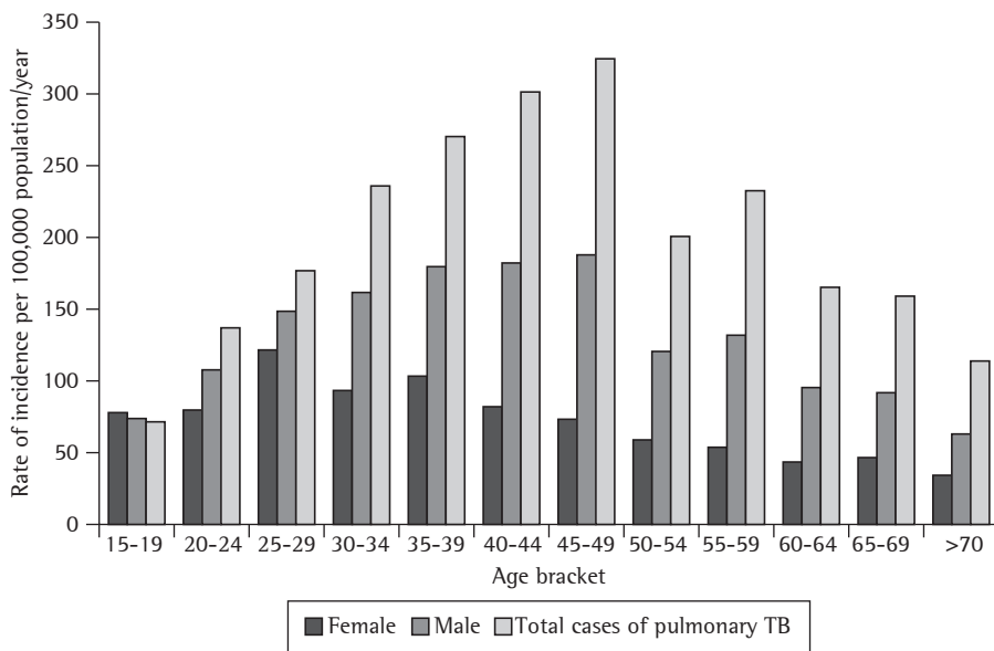
Figure 1 – Mean annual rate of incidence of pulmonary tuberculosis (TB) among the population ≥ 15 years of age, by age bracket and gender. City of Santos, Brazil. 2000-2004.

There was a predominance of males (69.1%) and of individuals in the 20-49 age bracket (69.5%). The overall median age was 40 years (35 years for females and 41 years for males). The data regarding the level of education showed that 55.2% (932/1,688) had had up to seven years of schooling, whereas 44.8% (756/1,688) had had eight or more years. As can be seen in Table 1, 50.7% (1,104/2,176) of the cases occurred in the poorer areas of the city (the Northwestern Zone and Downtown/Port area), whereas 0.8% (17/2,176) occurred in an area characterized as rural (the Continental Area).