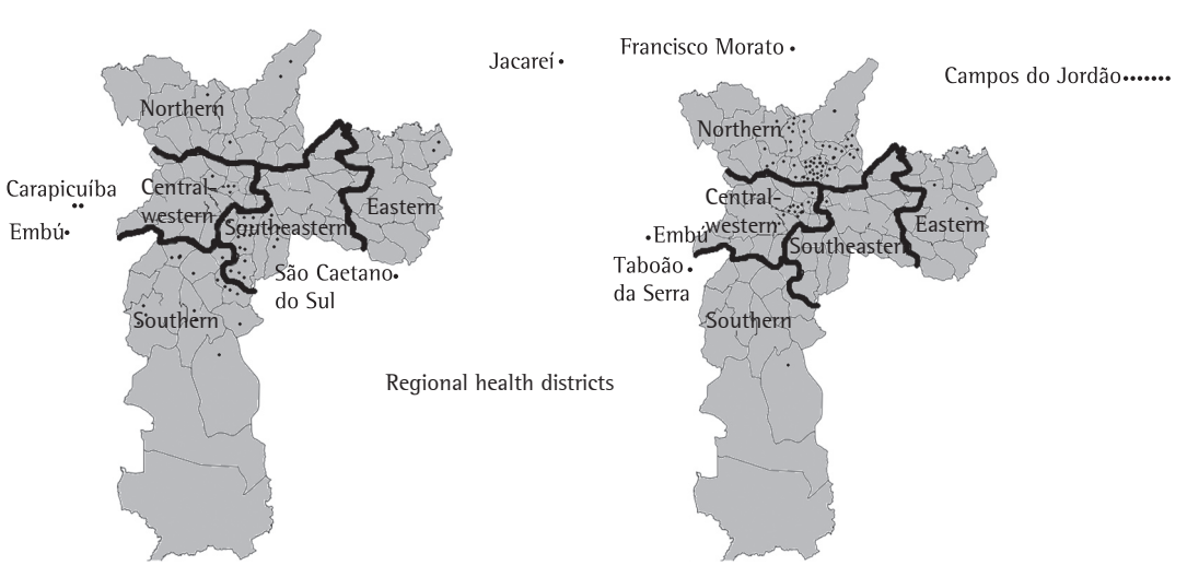
Figure 2 – District in which the primary health care clinics treating the tuberculosis patients discharged from the Hospital São Paulo and the Hospital do Mandaqui are located, São Paulo, Brazil, 2007.

The analysis of the locale of treatment of the discharged TB patients revealed that 39.7% of