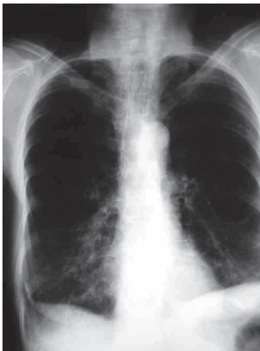
Figure 1 – Initial chest X-ray of the patient showing lung hyperinflation and severely decreased vascular markings in the upper halves of both lung fields.

Histoplasmosis is a systemic mycosis caused by the thermally dimorphic fungus H. capsulatum , which is found in its filamentous form as macroconidia (8–15 µm) or microconidia (2–4 µm) in the soil of endemic areas, such as the USA, Latin America, Southeast Asia and Africa. (1,2,9) In human tissue, H. capsulatum converts into oval, single-budding yeasts of 2–4 µm. (10) Infection generally occurs through the inhalation of airborne microconidia during work or recreational activities that bring the participants into contact with soil contaminated with bat or bird feces (in old buildings, bridges or caves). (4,10) In Brazil, H. capsulatum can be found in various states, such as Rio Grande do Sul, Rio de Janeiro, São Paulo, Minas Gerais and Mato Grosso. (2,11,12) The clinical spectrum of the disease ranges from acute pulmonary infection to chronic pulmonary infection and includes disseminated histoplasmosis. The disseminated form of the disease affects principally immunocompromised patients. Acute symptomatic H. capsulatum infection is