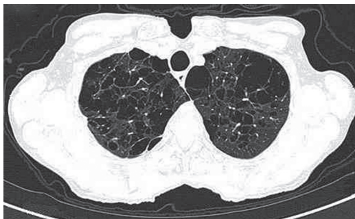
Figure 2 – HRCT scan revealing paraseptal emphysema, cavities and destruction of the adjacent parenchyma, predominantly in the upper lobes of the lungs.

Affecting the upper lobes of the lungs and accompanied by fibrosis, CCPH is related to continuous exposure to the agent and is the only fungal infection that seems to affect primarily patients of advanced age. (5,7) This might be