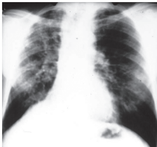
Figure 1 - Anteroposterior chest X-ray: bilateral and asymmetric reticulonodular infiltrate, predominantly in the two upper thirds.

In addition to aiding in the diagnosis, serologic tests can evaluate treatment response and disease recurrence. In these cases, elevated antibody titers usually precede clinical recurrence. Agar gel double immunodiffusion is the test that is most readily available in clinical practice, and its sensitivity and specificity are greater than 80% and 90%, respectively. Agar gel double immunodiffusion should always be titrated so that the interpretation of the therapeutic response is more accurate. (7)