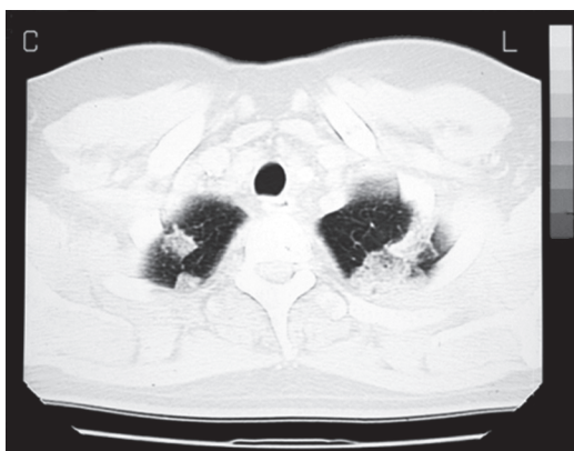
Figure 2 - Chest CT scan revealing condensation in the upper third of both lungs.

Having been diagnosed with paracoccidioidomycosis, the patient was treated with itraconazole (200 mg/day). After 7 days of therapy, his fever and cough had already subsided. On day 50 of therapy with itraconazole, the patient was asymptomatic and had gained 3 kg of body weight. In addition, the physical examination was normal. A chest X-ray performed on that day showed lungs without opacifications and normal pulmonary hila. The number of circulating eosinophils remained high until the initiation of treatment and then became normal (376/ \mu L). Inversely, the titer of anti- P. brasiliensis antibodies in serum increased to 1:512. Cure was achieved after four months of therapy with itraconazole (100 mg/day).