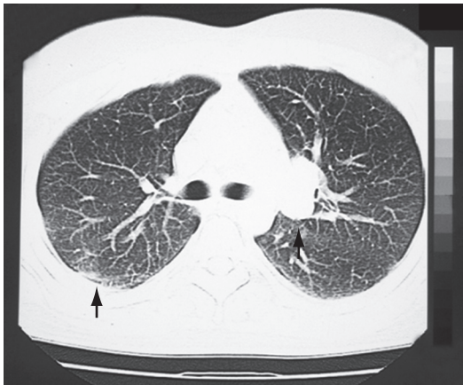
Figure 3 - Chest CT scan revealing peripheral condensation with right pleural involvement and left hilar lymph node enlargement.