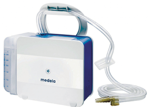
Figure 1 – Digital thoracic drainage system.

On the system screen, we can obtain information about what is currently happening, with the air leak status and the suction pressure used being displayed. In the chart, we have information about what happened in the preceding 24 h (Figure 2). Therefore, during medical or nursing rounds, we can consult this information and improve the decision-making process. In addition, the information can be exported to a computer with the ThopEasy software (Medela). We thus obtain more parameters, such as duration of drainage, with the date and the start and end time of system use, as well as minimum and maximum values for suction and air leaks (Figure 2). Suction can be quantified in various