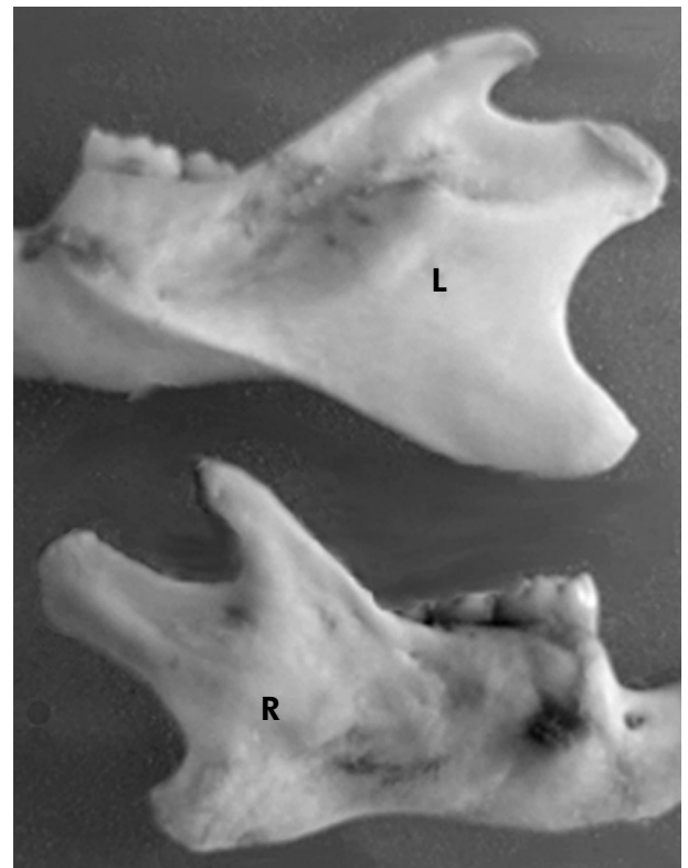
Figure 3 - Macroscopic view of the hemimandibles of a specimen from the removal group with atrophy, contour alterations and irregularities of the right (R) angular process. L = left side (control).

The mean values of the distances found on the radiographs of the skulls of the removal, dissection and sham-operated groups are listed in Table 1. In the removal and dissection groups there was a significant difference between sides for all measurements: tympanic bulla to mesial root of the first molar (TB-MR), tympanic bulla to infraorbital foramen (TB-IF) and infraorbital foramen to incisal point (IF-IP). However, in the sham-operated group there was no significant difference between sides for all measurements.