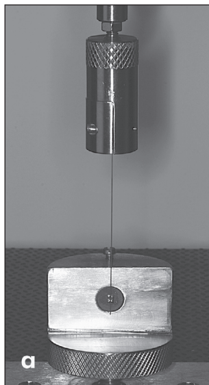
Figure 1 - Frictional test. a) Devices adapted to the universal test machine; b) close-up of the specimen adapted to the device during the test.