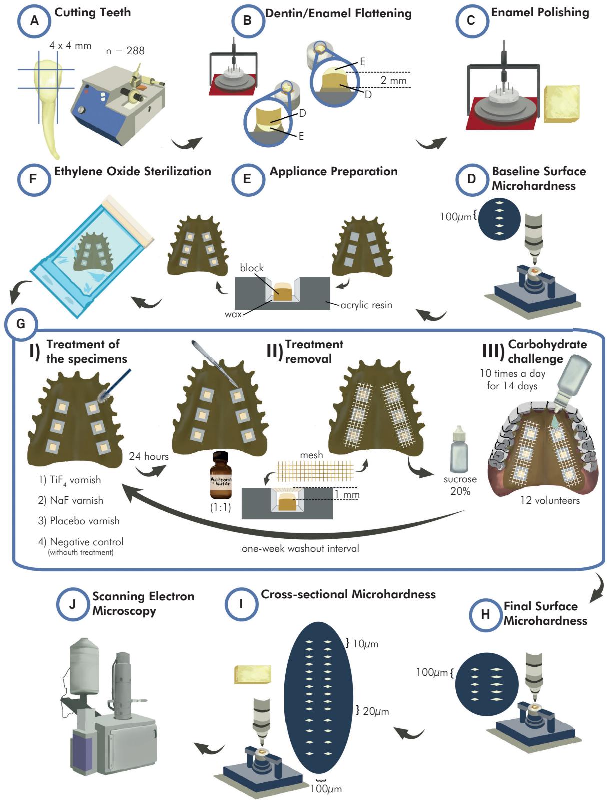
Figure 1. Schematic diagram of process steps: A - Cutting Teeth; B – Dentin/Enamel Flattening; C - Enamel Polish; D - Baseline Surface Microhardness; E – Appliance Preparation; F – Ethylene Oxide Sterilization; G (I) – Treatment of the Specimens, (II) – Treatment Removal, (III) – Carbohydrate challenge; H - Final Surface Microhardness; I – Cross-sectional Microhardness; J - Scanning Electron Microscopy.