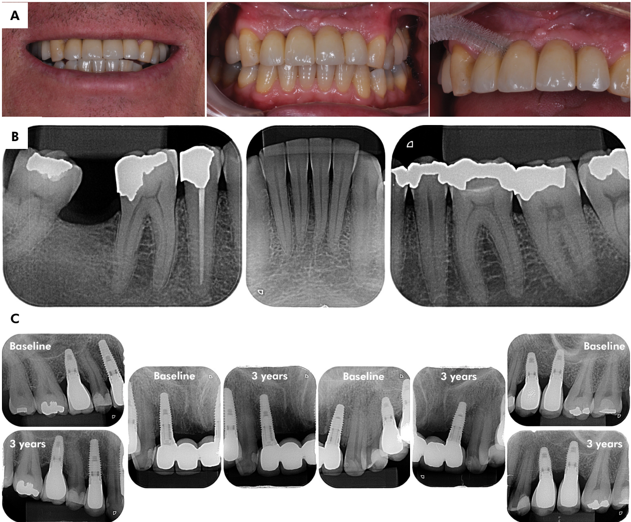
Figure 2. (A) Clinical pictures of a patient receiving peri-implant maintenance for 3 years. (B) Radiographic images of the lower remaining teeth showing no/limited marginal bone loss indicating a negative history of periodontitis. (C) Radiographic images showing no/limited marginal bone levels around dental implants following prosthetic rehabilitation and after 3 years.