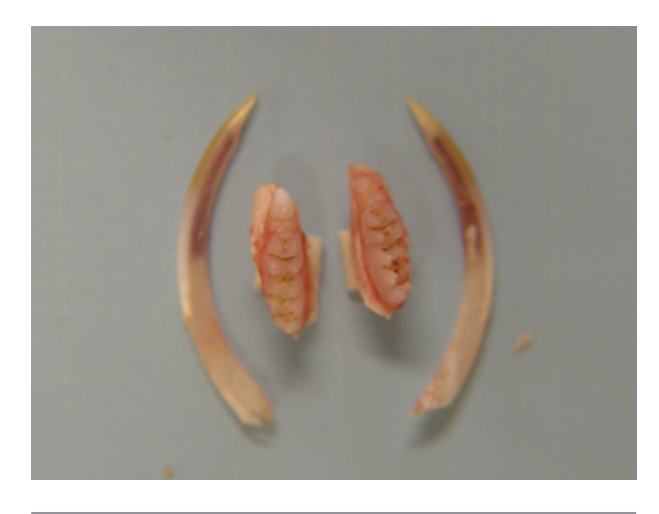
Figure 1. Mandibular incisor teeth and first molar teeth removed from male offspring of female rats.

The mandibular IT and MT were embedded in acrylic resin (Figure 2, A and B), and the specimens were ground and polished for cross-sectional hardness analysis with a microhardness tester (Shimadzu HMV-2000, Shimadzu Co., Kyoto, Japan) equipped with a Knoop indenter and a static load