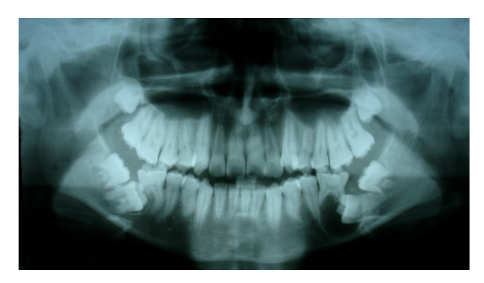
Figure 1. Panoramic radiograph showing a radiolucent area related to a permanent mandibular left second molar.

Based on the observation of radiographic and microscopic aspects, the diagnosis was made of a dentigerous cyst. The acrylic resin drain was kept in place for 90 days, after which a marked decrease in lesion size and eruption of the mandibular left third molar were observed (Figure 4).