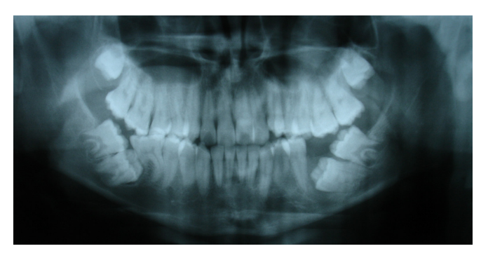
Figure 4. Panoramic radiograph showing a significant decrease in lesion size and eruption of the mandibular left third molar.